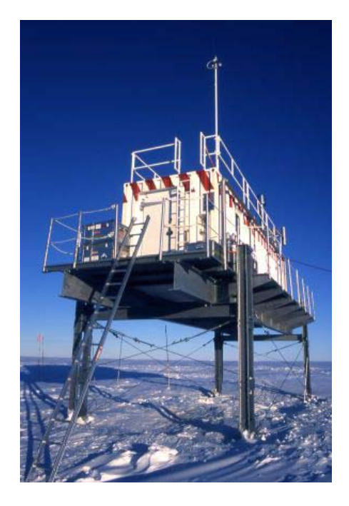
Figure 3: The GAW Global Air Chemistry Observatory Neumayer.

The first air chemistry observatory at Neumayer was initiated and constructed by the Institut für Umweltphysik, University of Heidelberg (UHEI-IUP) in 1982. Following almost 13 years of operation, the technical equipment and the data acquisition facilities had to be renewed. The present observatory was designed in collaboration between AWI and UHEI-IUP as a container building placed on a platform some metres above the snow surface, see Figure 3.