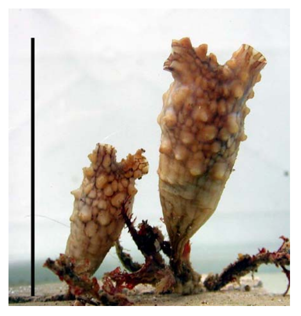
Figure 1. Styela clava specimens from Helgoland (scale bare 10 cm)

Helgoland is the only offshore island in the SE North Sea and is situated in the centre of cyclonic water currents (Giménez and Dick 2007). It is difficult to see how S. clava could have reached Helgoland by natural means (Davis et al. 2007). However, there are up to five visits daily by ferryboats and many visits from recreational vessels, which sail from " S. clava ports"