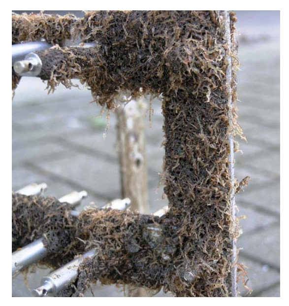
Figure 3. Experimental frame deployed west of Zeebrugge, Belgium in 2007 showing dense aggregations of Caprella mutica after 12 weeks immersion

Mediterranean Sea on account of the high summer seawater temperatures (Cook et al. 2006).