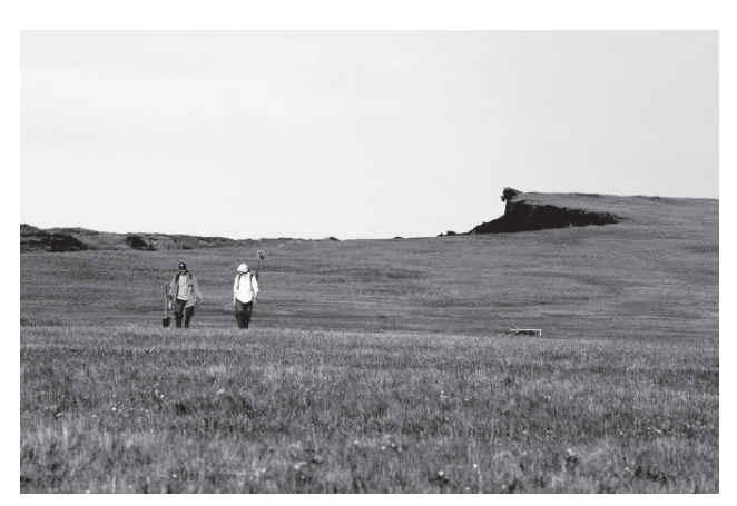
Figure 3. View from the alas bottom to the yedoma hill.

Mud boils are the result of cryoturbation caused by frost pressing. In consequence, muddy soil flooded the ground.