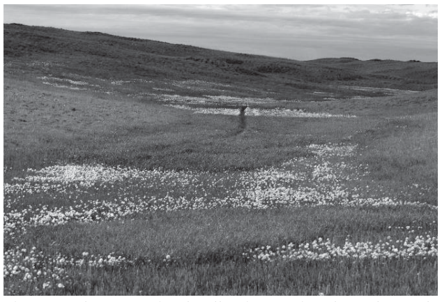
Figure 8. Thermo-erosional valley intersecting the yedoma of Oyogos Yar. Main constituent here is Eriophorum scheuchzeri causing a green spectral signature.

Interestingly, genuine aquatics were widely lacking. Only Hippuris vulgaris was solitarily found in a sterile form. The white-flowered Ranunculus pallasii and Caltha palustris grew immersed in some ponds within the Alas depressions.