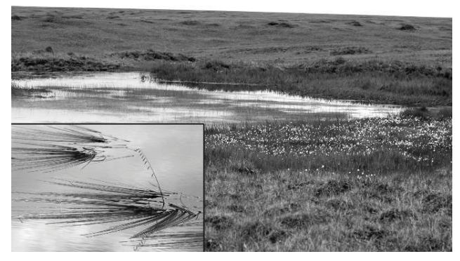
Figure 7. Thermokarst pond with dominating Pleuropogon sabinei growing immersed in the water (inserted photo).