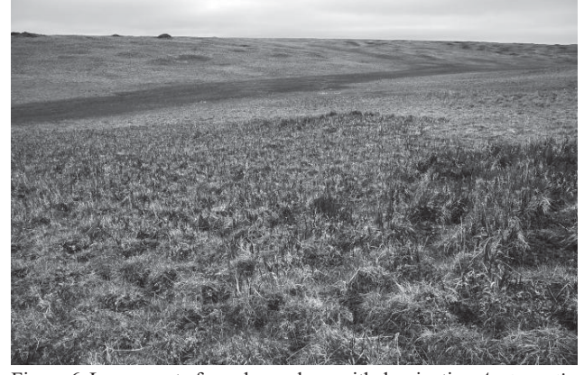
Figure 6. Lower part of a yedoma slope with dominating Arctagostis latifolia . In the background, a thermo-erosional valley with reddish spectral signature (here: dark) is visible.