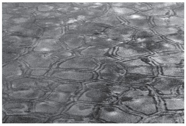
Figure 9. Bottom of a thermokarst depression with a water table above the ground. The polygonal surface patterns are visually strengthened by vegetational differentiation (compare Fig. 10).