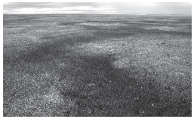
Figure 10. The wettest places in high center polygonal wetland tundra are the inter-polygonal trenches. Here, Eriophorum polystachion is the main constituent, causing a reddish (here dark) pattern.