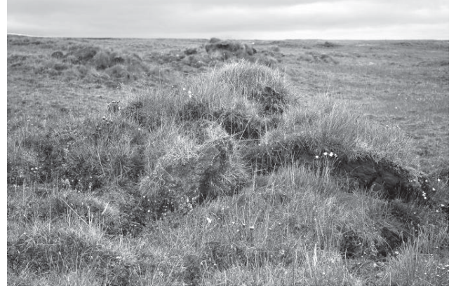
Figure 4. Thermokarst mounds on the yedoma at Oyogos Yar.

The substrate is silty and well-drained. Mud boils occur at places most exposed and windswept on the Yedoma. Plants occur here only between such mud spots; the coverage is consequently very low with 20 to 40% (Fig. 5). Potentilla hyparctica, Salix polaris, and low growing grasses, and rushes like Festuca brachyphylla, Deschampsia borealis, and Luzula confusa are the main constituents of such habitats In addition, herbs such as Lloydia serotina, Cardamine bellidifolia, Androsace triflora, and Tephroseris atropurpurea occur in lower abundance.