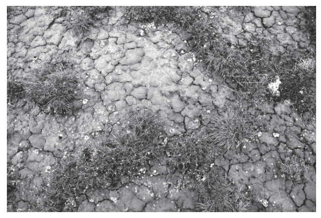
Figure 5. Mud boil at the top of the yedoma visible in Figure 3.