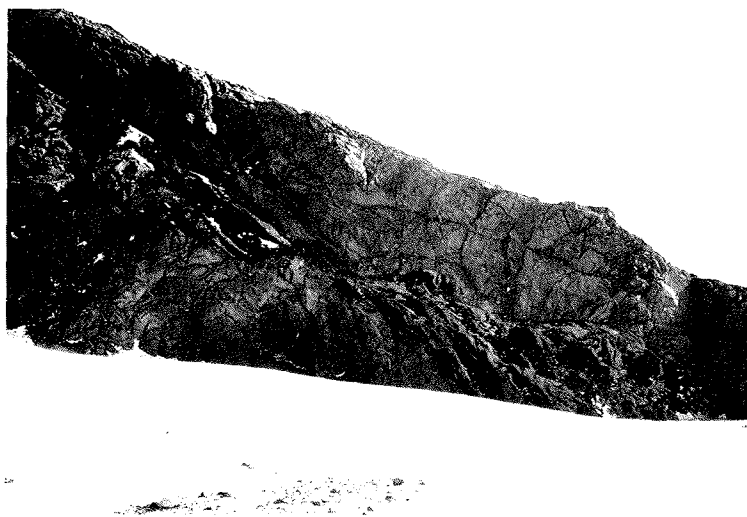
Fig. 2: Thrust plane in Komatsu Nunatak. View is towards the north; the top has moved towards the left (SW).

The formation of pegmatites begins halfway up Boggs Valley. They become thicker (several metres) and more frequent towards the W. They suffered at least one phase of folding. In the upper Boggs Valley small granitic dikes and bodies (some tens of metres) appear additionally. Larger granites form the Komatsu Nunataks to the W of Boggs Valley.