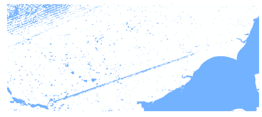
Figure 3 Examples for Artefacts in the ENVISAT ASAR WS water surface product: due to errors in original data (Western Taymir)