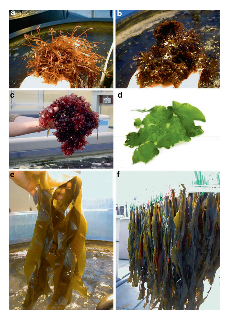
Fig. 22.2 Examples of macroalgae grown in aquaculture. (a) Solieria , a carrageenophyte; (b) Chondrus crispus "Irish Moss" carrageenophyte; (c) Palmaria palmata , used as feed for abalone; (d) Ulva lactuca , used for bioremediation (uptake of excess nutrients) and feed; (e, f) Saccharina latissima , after 9 months in tank culture and (f) phylloids drying for storage demonstrating how evenly they are grown.

Next in the ranking according to production volume are countries mostly from Africa (e.g., Tanzania, Madagascar, South Africa, and Namibia) with 108,400 t in 2009 and Western Europe (e.g., Spain, France, Italy, and the Russian Federation), which are responsible for the remaining biomass production volumes. Finally, the Pacific Ocean Islands grow just a small amount of seaweed and produced 2,377 tons in 2009 (Fiji, Kiribati, and Solomon Islands) (FAO 2011a, 2010b).