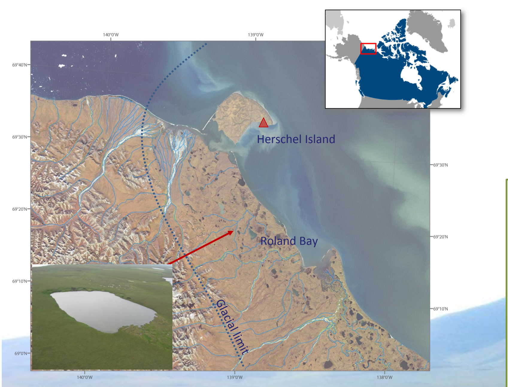
Fig. 1 Map of Yukon Coastal Plain and Herschel Island, showing lake location and western limit of former Laurentide Ice Sheet (map base compiled by Lantuit)

Regional climate variability and associated changes in vegetation