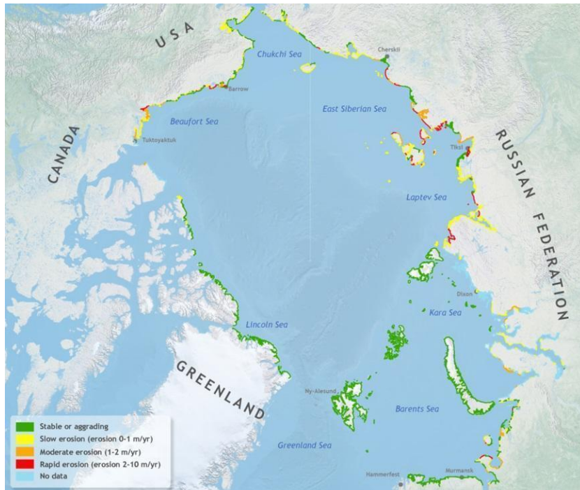
Figure 3: Arctic coastal erosion rates

As a tie between monitoring sites and the global observation of permafrost underlain land area, monitoring transects across permafrost zones in representative regions (where changes are predicted) may be established. Some transects have been recommended within the ESA DUE Permafrost project based on a user survey. A refined version (including the Antarctic Peninsula) is provided as supplementary material to this document (Figure 2b). Furthermore, arctic coastal areas impacted by active erosion should be monitored regularly (Figure 3).