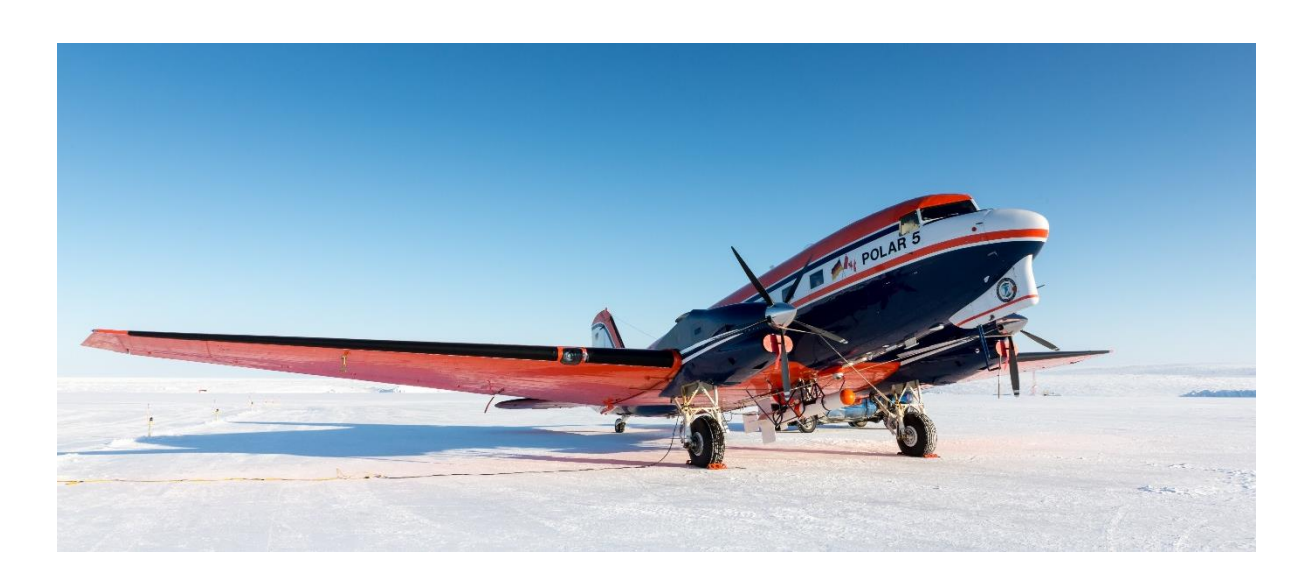
Figure 2: Polar-5, a polar research aircraft of the Alfred Wegener Institute outfitted with an AEM sensor for direct seaice thickness observations. York University operates are similar aircraft of the same model and scientific payload.