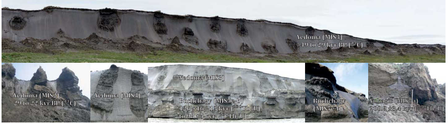
Figure 2. Ice Complex deposits of four generations exposed at the southern coast of Bol'shoy Lyakhovsky Island (New Siberian Archipelago).

The southern coast of Bol'shoy Lykhovsky Island (New Siberian Archipelago, Figure 2) exposes permafrost dating back to about 200 kyr ago <sup>(2)</sup>. This is among the longest record of late Quaternary terrestrial permafrost deposition in East Siberia. The most prominent Yedoma IC <sup>(3,4)</sup> is radiocarbon-dated between about >55 and 22 kyr BP ( MIS3-2 ). Older Ice Complex deposits are the Buchchagy IC <sup>(5)</sup> dated from about 126 to 98 kyr ( MIS5 ) by <sup>230</sup>Th/U radioisotope disequilibria in peat, and the Yukagir IC <sup>(2)</sup> dated to about 200 kyr by <sup>230</sup>Th/U ( MIS7a ).