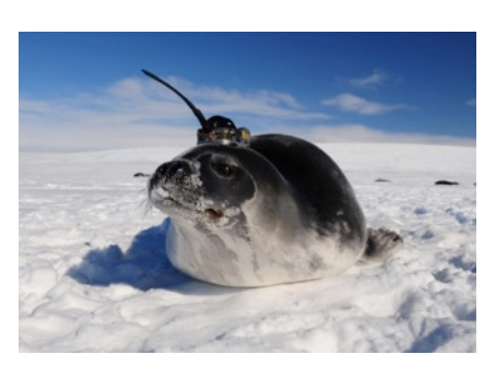
Figure 1: Weddell seal carrying a CTD-SRDL instrument that collects temperature and salinity profiles while the animal is at sea (Credits: D. Costa).

Marine mammals help gather information on some of the harshest environments on the planet, through the use of miniaturized ocean sensors glued on their fur. Since 2004, hundreds of diving marine animals, mainly Antarctic and Arctic seals, have been fitted with a new generation of Argos tags developed by the Sea Mammal Research Unit of the University of St Andrews in Scotland, UK. These tags investigate the at-sea ecology of these animals while simultaneously collecting valuable oceanographic data. Some of the study species travel thousands of kilometres continuously diving to great depths (up to 2100 m). The resulting data are freely available to the global scientific community at now http://www.meop.net. Despite great progress in their reliability and data accuracy, the current generation of loggers while approaching standard ARGO quality specifications have yet to match them. Yet, improvements are underway; they involve updating the technology, implementing a more systematic phase of calibration and taking benefit of the recently acquired knowledge on the dynamical response of sensors. Together these efforts are rapidly transforming animal tagging into one of the most important sources of oceanographic data in polar regions and in many coastal areas.