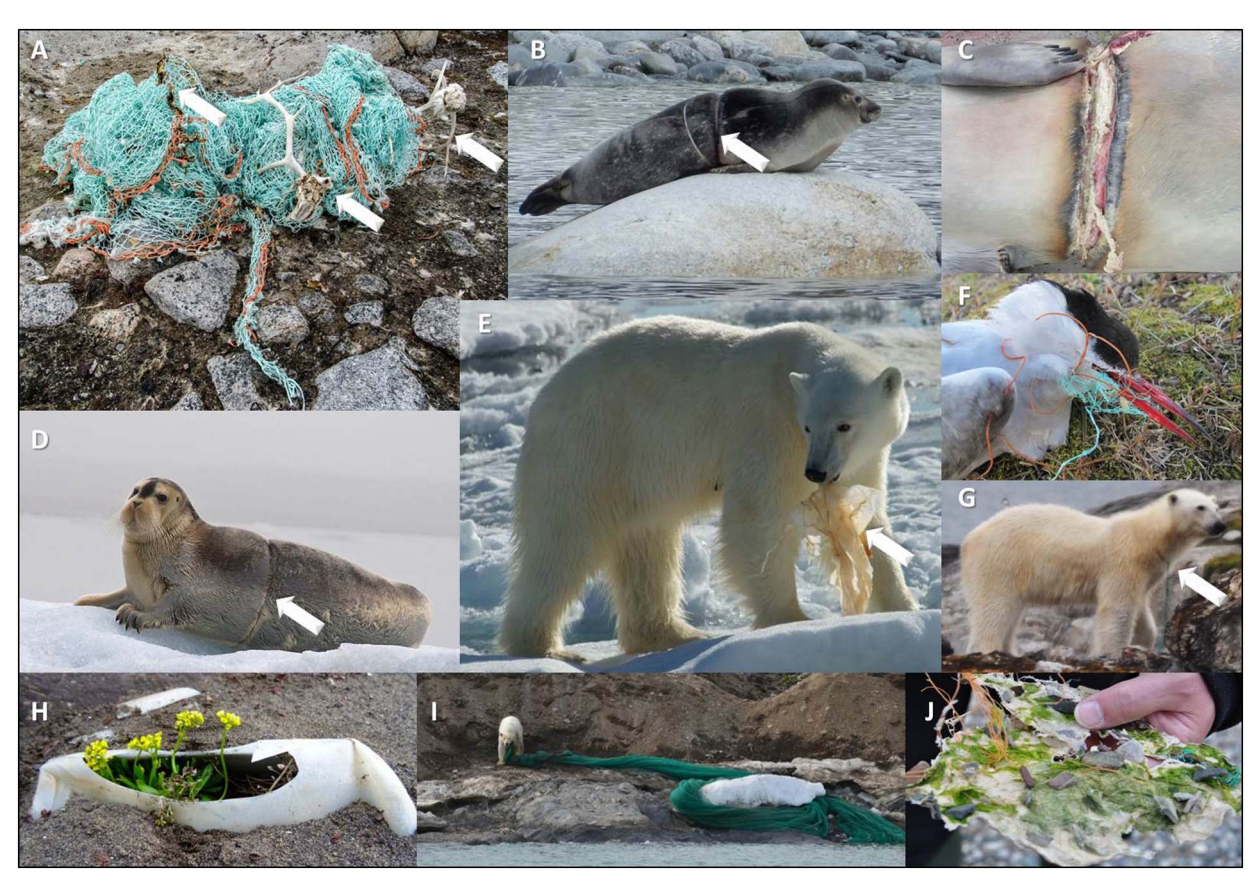
Fig. 2. Images taken by citizen scientists showing interactions of Arctic biota with marine litter on Svalbard beaches: (A) fishing net entwined with fucoid macroalgae and two entangled antlers and skulls of reindeer (Rangifer tarandus platyrhynchus) from Chermsideøya (Nordaustlandet); (B) harbour seal (Phoca vitulina) entangled in rope cutting through the skin, (C) causing severe wounding; (D) bearded seal (Erignathus barbatus) with rope tied around its belly in the Hornsund/Bellsund area; (E) polar bear (Ursus maritimus) with plastic shred in its mouth on ice floe in Hinlopenstreet; (F) dolly rope fibers wrapped around the beak of a perished Arctic tern (Sterna paradisaea); (G) polar bear with fisheries rope tangled around its neck in the Raudfjord area; (H) Arctic whitlow-grass (Draba bellii) in contact with plastic container; (I) polar bear with beached fishing net at Sorgfjorden; (J) conglomerate of green algae (cf. Ulva spp.) and dolly rope fibers.

Recently, skulls of reindeer ( Rangifer tarandus platyrhynchus ) entangled in fishing nets deposited on the beaches of Svalbard have become a regular sight (Fig. 2A). In the absence of more suitable food