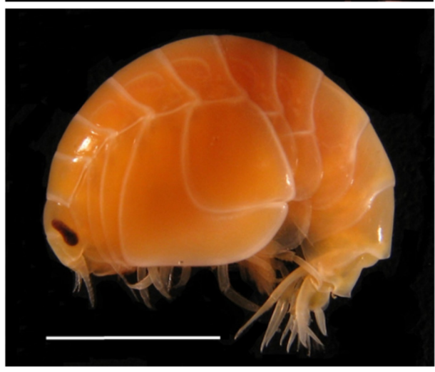
Fig. 2. Overview of different amphipod scavenger morphologies. Upper photograph: the deep-sea supergiant Alicella gigantea (Alicellidae), scale bar = 2 cm. Middle photograph: one of the several giant deep-sea amphipod species of the Eurythenes complex, Eurythenes maldoror (Lysianassoidea: Eurytheneidae), scale bar = 1 cm. Lower photograph: a common carrion-feeder of the Antarctic shelf and slope environment, Waldeckia obesa (Lysianassoidea: Lysianassidae), scale bar = 0.5 cm.

hypothesized to originate from a predator-prey co-evolution with notothenioid fishes (Brandt, 2000). In contrast to these examples, the general bauplan of scavenging shallow-water and deep-sea lysianassoid amphipods is remarkably conservative: spines and teeth are absent. In analogy to the naked necks of vultures with which they efficiently probe carcasses, dorsal teeth and spines would hinder the entering and tunnelling of amphipods in large carrion. Lysianassoids are known to enter carcasses through incisions or body openings, mining the muscle tissue between the skeletal structures of bony fish or between the connective tissue, skin and blubber in the case of cetacean carcasses (Jones et al., 1998).