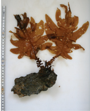
Figure 2: Undaria pinnatifida sporophytes collected at Sylt, Germany. (Left) Specimens washed up in the intertidal between Rantum and Hörnum during low tide. (Middle) Large fertile sporophyte found floating in tide pools of the sampled oyster reef. (Right) Individuals collected growing on oysters in the tide pools.