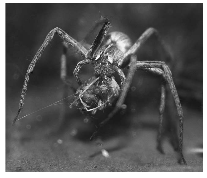
PLATE 1. Predator-prey interaction between the lycosid spider Pisaura mirabilis and the cricket Gryllus assimilis .