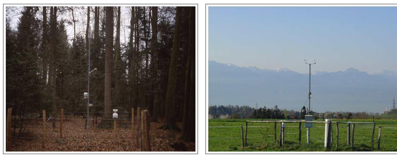
(a) LAB: Forest station