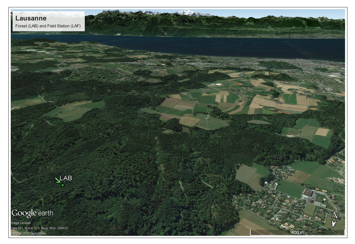
Figure 1: Site aerial photo from both Lausanne stations.

The measurements were carried out at Lausanne in the Swiss Canton of Vaud, situated in the north of the city Lausanne which is part of Swiss Midlands (Fig. 1). Time series of two plots have been recorded, one within the forest (Fig. 2a) and a second one outside of the forest (field station, Fig. 2b). Tab. 1 shows further details on the research station characteristics.