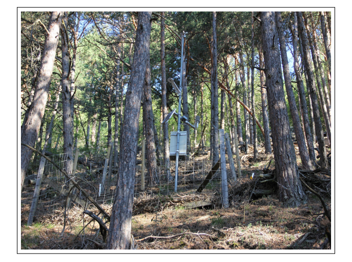
Figure 1: LEB: Forest station