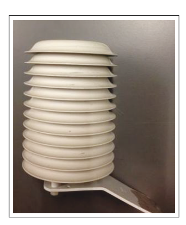
Figure 2: Combined air temperature and humidity sensor