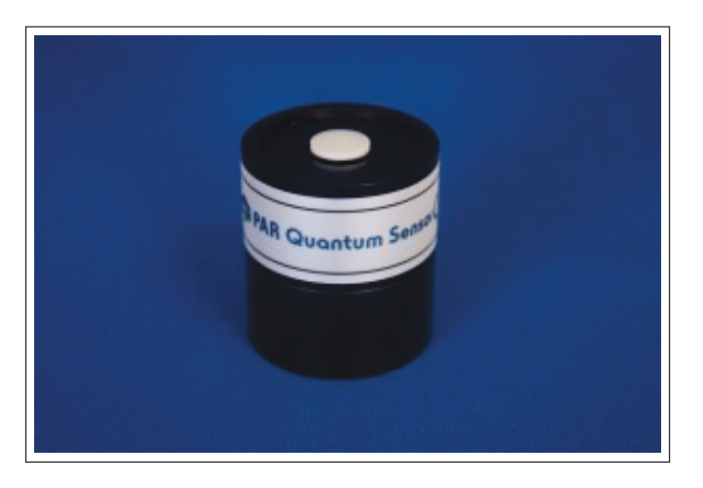
Figure 4: PAR sensor