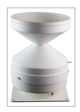
Figure 3: Precipitation sensor