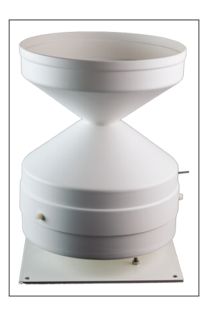
Figure 4: Precipitation sensor