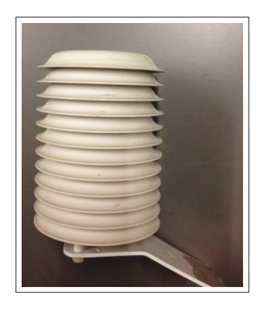
Figure 3: Combined air temperature and humidity sensor