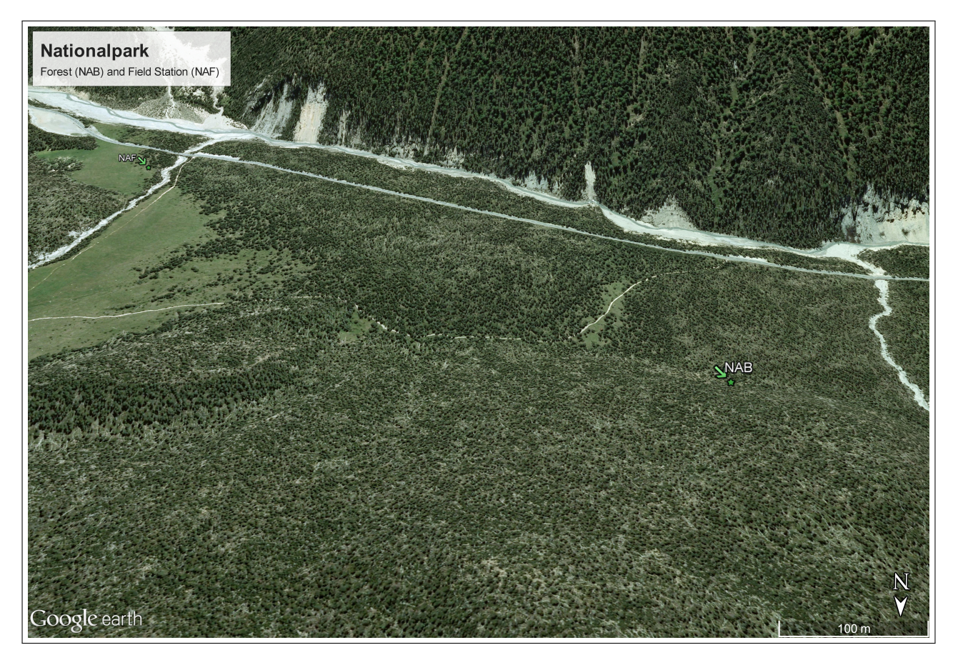
Figure 1: Site aerial photo from both Nationalpark stations.

The measurements were carried out at the Swiss Nationalpark in the Canton of Grisons, situated next to the road of the Ofenpass connecting the high valley Engadin and the Müstair Valley (Fig. 1). Time series of two plots have been recorded, one within the forest (Fig. 2a) and a second one outside of the forest (field station, Fig. 2b). Tab. 1 shows further details on the research station characteristics.