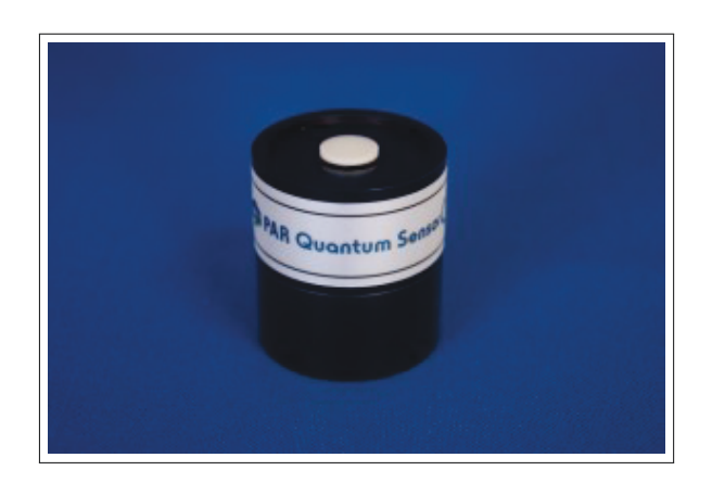
Figure 5: PAR sensor