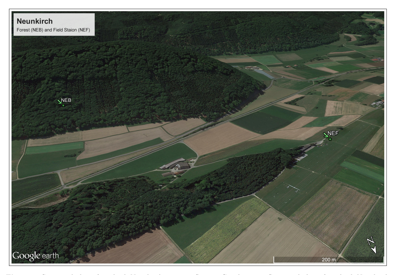
Figure 1: Site aerial photo from both Neunkirch stations.

The measurements were carried out at Neunkirch in the Swiss Canton of Schaffhausen, situated on the northern hillside of a small hill in the viticulture region Klettgau (Fig. 1). Time series of two plots have been recorded, one within the forest (Fig. 2a) and a second one outside of the forest (field station, Fig. 2b). Tab. 1 shows further details on the research station characteristics.