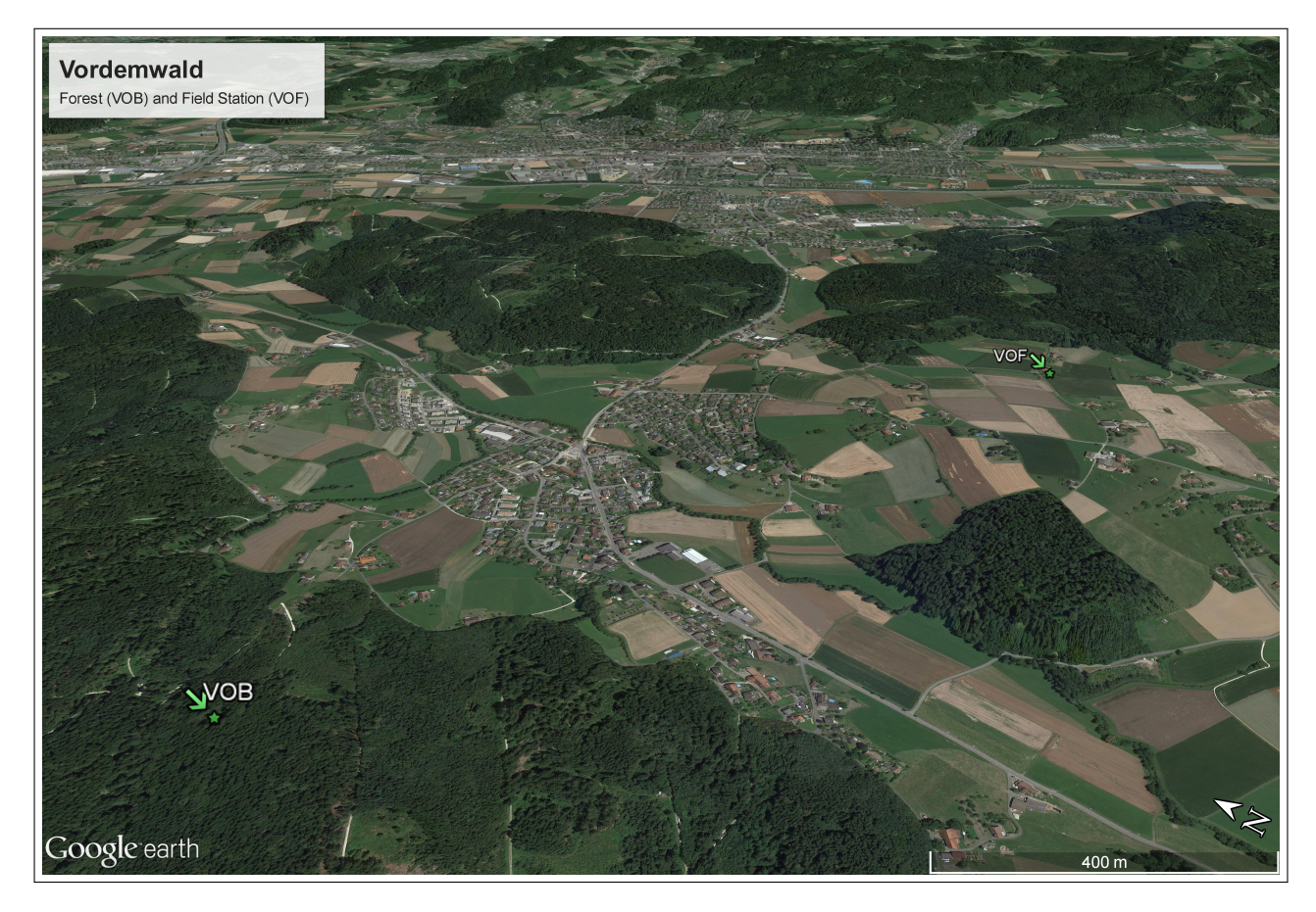
Figure 1: Site aerial photo from both Vordemwald stations.

The measurements were carried out at Vordemwald in the Swiss Canton of Aargau, situated around the community of Vordemwald belonging to the Swiss Midlands (Fig. 1). Time series of two plots have been recorded, one within the forest (Fig. 2a) and a second one outside of the forest (field station, Fig. 2b). Tab. 1 shows further details on the research station characteristics.