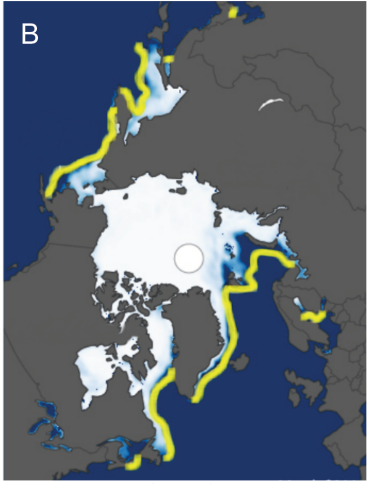
Lost ice dispersal corridors isolate terrestrial populations & restrict gene flow/new narine pop gene flow