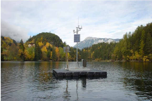
Fig. 2. Monitoring platform at Piburger See