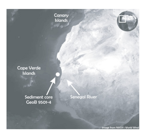
Figure 1. Map of the sampling point of the multi-core GeoB9501-4 recovered during METEOR-Cruise M65/1 on the continental slope off NW Africa (Senegal Mudbelt, northern rim of Mauritanian Canyon from the depth 330 m).

the problem of self-attenuation in volume samples: experimental [1, 2] and mathematical – using Monte Carlo simulations [3]. The approach combining both experimental measurements and mathematical MC simulations was proposed by other authors [4, 5].