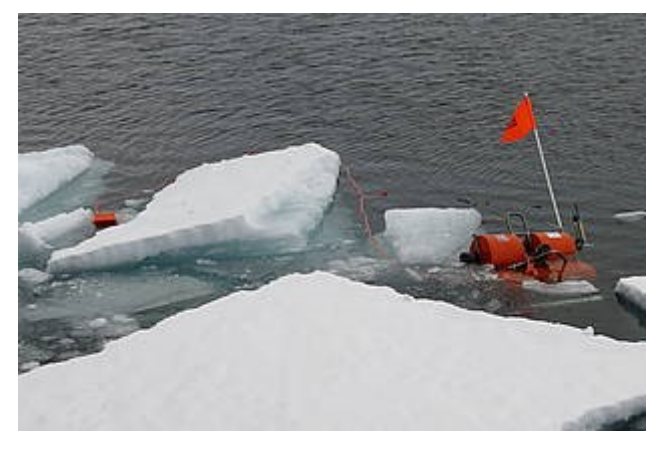
Fig. 3: An ocean bottom seismometer surfaced close to a sheet of ice.

In addition to the reflection seismic data, that depicts the shallower crust, a refraction seismic profile was collected, consisting of 9 equally spaced (10 km) ocean bottom seismometers (OBS) for further insight to deeper crustal structures such as the boundary of Greenland and the Morris Jessup Rise.