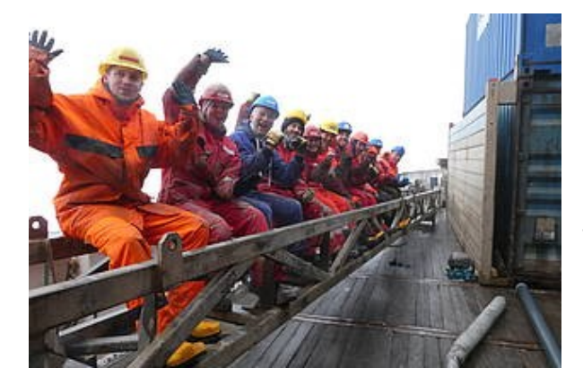
Fig. 4: RV Polarstern in the mainly ice free Greenlandic sea at 78°N.

a danger for it. The mission to retrieve a GPS-Station from the TU Dresden and Collection of more Samples on land was given up, due to the absence of suitable weather for flying.