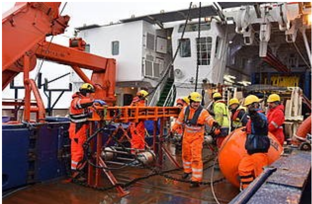
Fig. 2: The airgun array is prepared for deployment to subsequently generate signals for the refraction seismic survey.

At 84°18.73'N we reached the end of the BGR's most northerly reflection seismic profile so far. Thickening ice made us shift our work westwards to the eastern Lincoln Sea, where helicopter borne ice reconnaissance promised better working conditions.