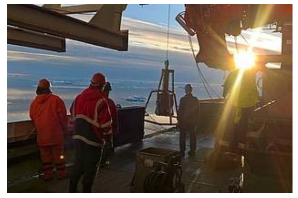
Fig. 2: The box corer is retrieved after successful extraction of samples.