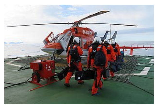
Fig. 3: Teams of geologists are preparing to be flown to the near coastal outcrops.

Thanks to the good weather and ice condition forecast, as well as the predictive and safe ship navigation any collision of our dragged 3 km streamer and drifting ice flows or smaller ice bergs (growler) could be avoided. Besides seismics, other geophysical methods like gravimetry and magnetics could be deployed, giving us further insight to the sub-seafloor structures of the only 150 - 300 meters deep shelf