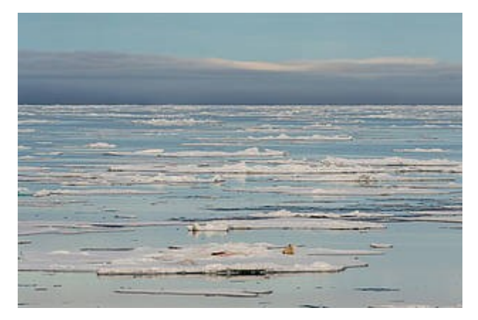
Fig. 1: Fields of sea ice in front of Kronprins Christian land- a polar bear eating his prey.

Additional helicopter flights were planned to proceed with on land sampling in the permitted area around 120 km away, unfortunately these plans had to be aborted because of heavy fog that only cleared for a brief period of time. Said time window was too short to cover the distance of 120 km in a helicopter and a Narwhale protection area made it impossible to shorten the necessary flight distance by moving the ship closer to the shore. For that reason geological sampling was postponed to the next good weather window and we switched over to reflections seismic measurements.