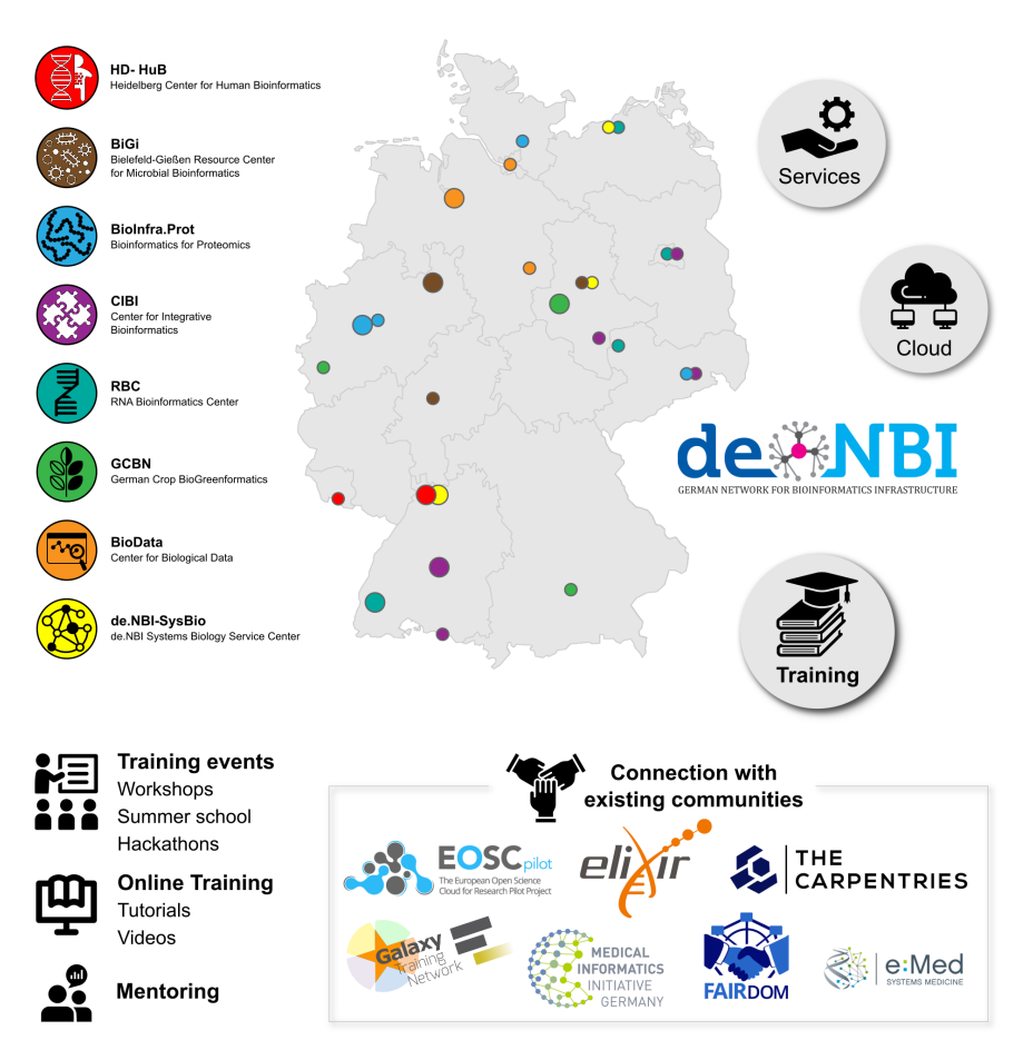
Figure 1. Training topics and locations of the eight de.NBI service centers in Germany and their connections with existing German and European communities. On the left side, the service centers are shown. These centers organize specific training events, create online training material and provide mentoring. In the middle, the map of Germany includes all de.NBI locations. The different colors represent the corresponding service center (see logos on the left side).

19 training experts from each service center and is led by Oliver Kohlbacher (Eberhard Karls University of Tübingen - Chair) and Daniel Wibberg (Bielefeld University - Deputy Chair) (status as of July 2020). SIG 3 collects all planned de.NBI training activities and provides a structured process of reporting, documenting, and monitoring all training events. The general goal of de.NBI is to develop a national bioinformatics training program for Germany.