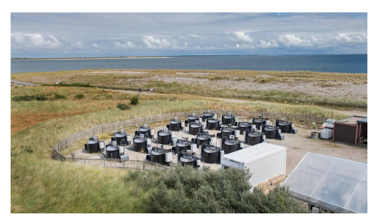
Figure 7: AWISOM mesocosms