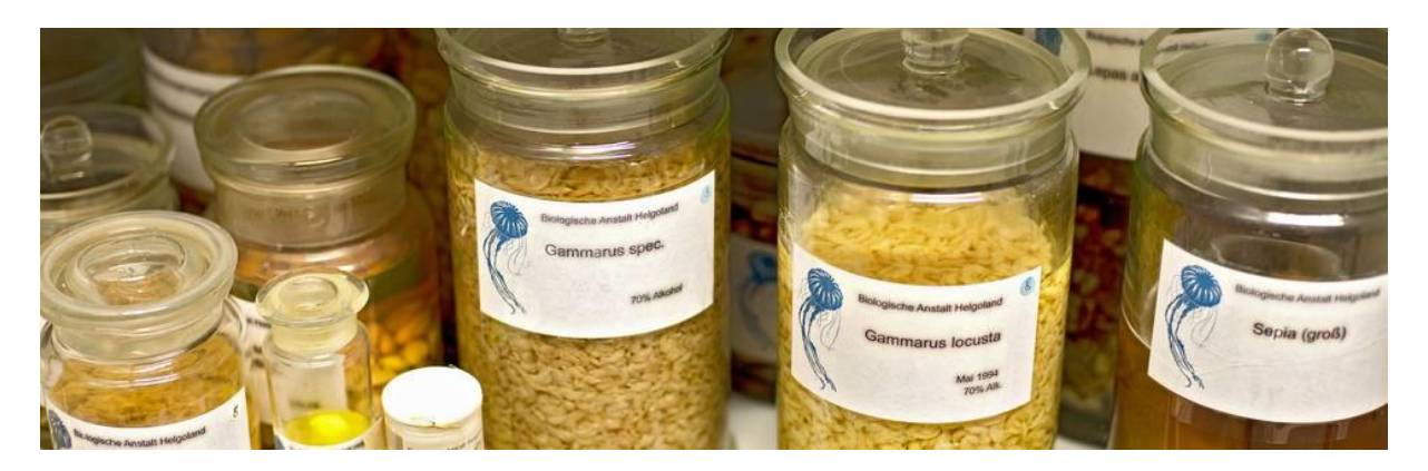
Figure 6: Conserved specimens in glass jars for university usage