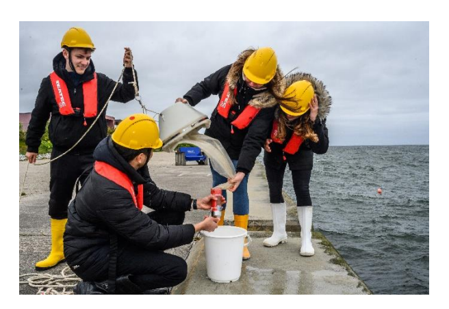
Figure 3: A university course takes plankton samples