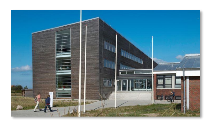
Figure 2: Wadden Sea Station on Sylt