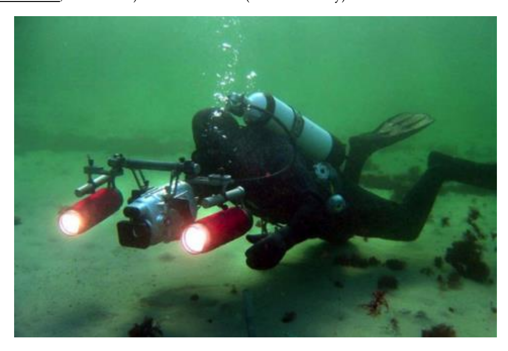
Figure 9: Diver with photo equipment

The <u>AWI-Centre for Scientific Diving</u> provides highly-trained year-round scientific diver support for the set-up and maintenance of sensors and experimental equipment within the MarGate underwater experimental area off Helgoland (Fischer al 2020, Fischer et al 2021). The area is about 270 x 100 m in size, located between 5 and 10 m water depth, and is officially classified as a maritime exclusive zone for ship traffic. Six tetrapod-fields have been installed in 5 and 10 m water depth to study the effects of artificial breakwaters on the shallow water fish and macro-invertebrate community. Since summer 2012, the MarGate field contains the first <u>German underwater node system</u> developed in the framework of <u>COSYNA</u>. This system provides continuous and manageable power and network access at 10 separate underwater mutable docking ports, each providing 48V/200W and 100 MBit/1 GBit network connection. Each port can be individually addressed and managed by its registered user (sensor owner) from anywhere in the world to remotely control and manage even complex sensor units. As well as basic hydrographical parameters from the area, the AWI operates multiple sensor systems for the main abiotic and biotic variables (temperature, salinity, depth, tide, turbidity, oxygen, chl-a fluorescence, 3D-current) in near real time (about 1 h delay).