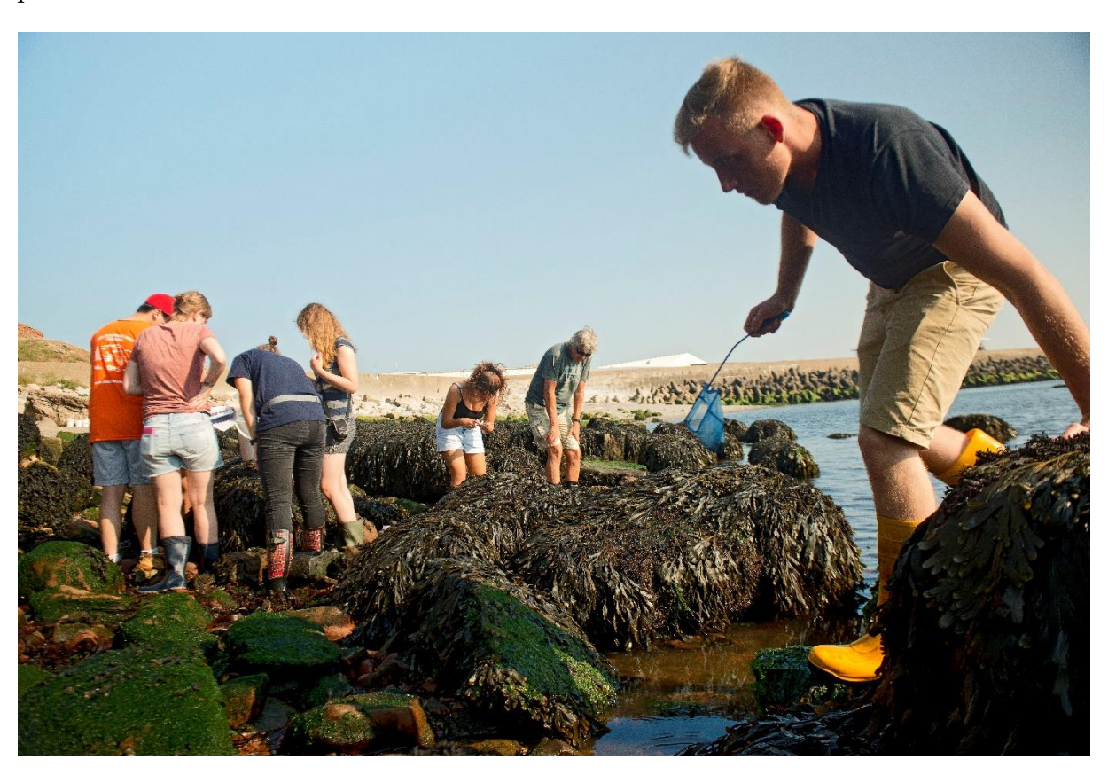
Figure 5: School lab OPENSEA taking samples in the intertidal