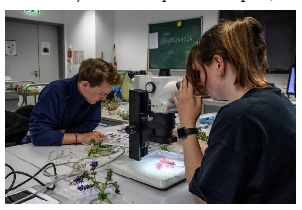
Figure 4: Students determining species with binoculars in the course room