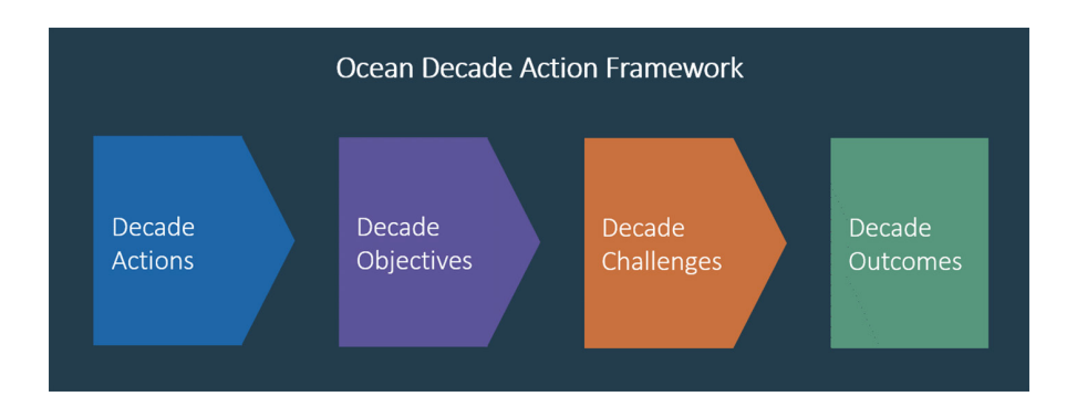
FIGURE 1 Schematic summary of the Ocean Decade Action Framework (for further details see Ocean Decade Implementation Plan, UNESCO-IOC, 2021).

'shifting the burden of response onto vulnerable parties' (for further details, see Blythe et al., 2018).