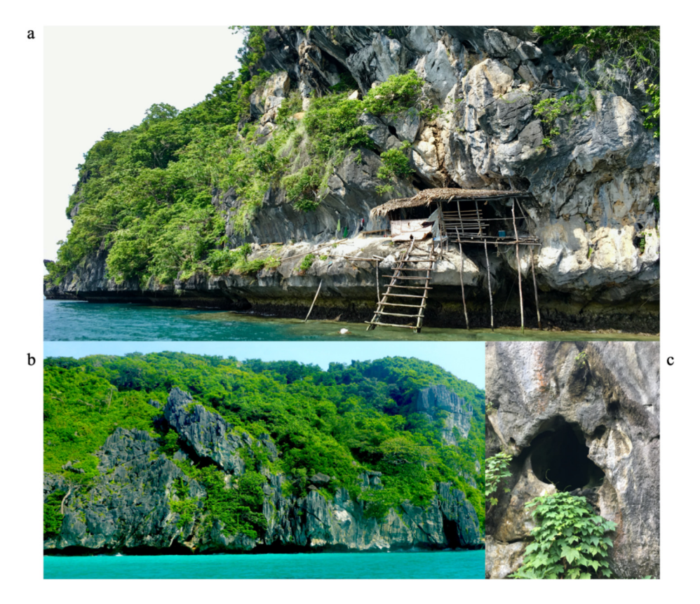
Figure 2. Limestone cliffs in seascapes of northern Palawan: a) limestone cliffs, b) harvest collection point, and c) entrance to cave butas .

month of the year. The Habagat (southwest monsoon) emerges in late June to December, bringing a 'rainy season' of high humidity and south-westerly winds, increasing the risks of flooding and typhoons. From July to August, stronger winds and heavy rain reduce livelihood opportunities, leading to degrees of hardship and reliance on the 'barter' of cashew nuts for rice and other products. Most uma rice stores have been consumed by June or July and families await the rice harvest in late August or September. From June to October, fishers catch crab using artisanal traps around mangrove areas. The fishing season starts in August, targeting multiple species using gillnets and hook-and-lines for subsistence and commercial purposes. Other seasonal livelihood opportunities include tourism and hired labour.