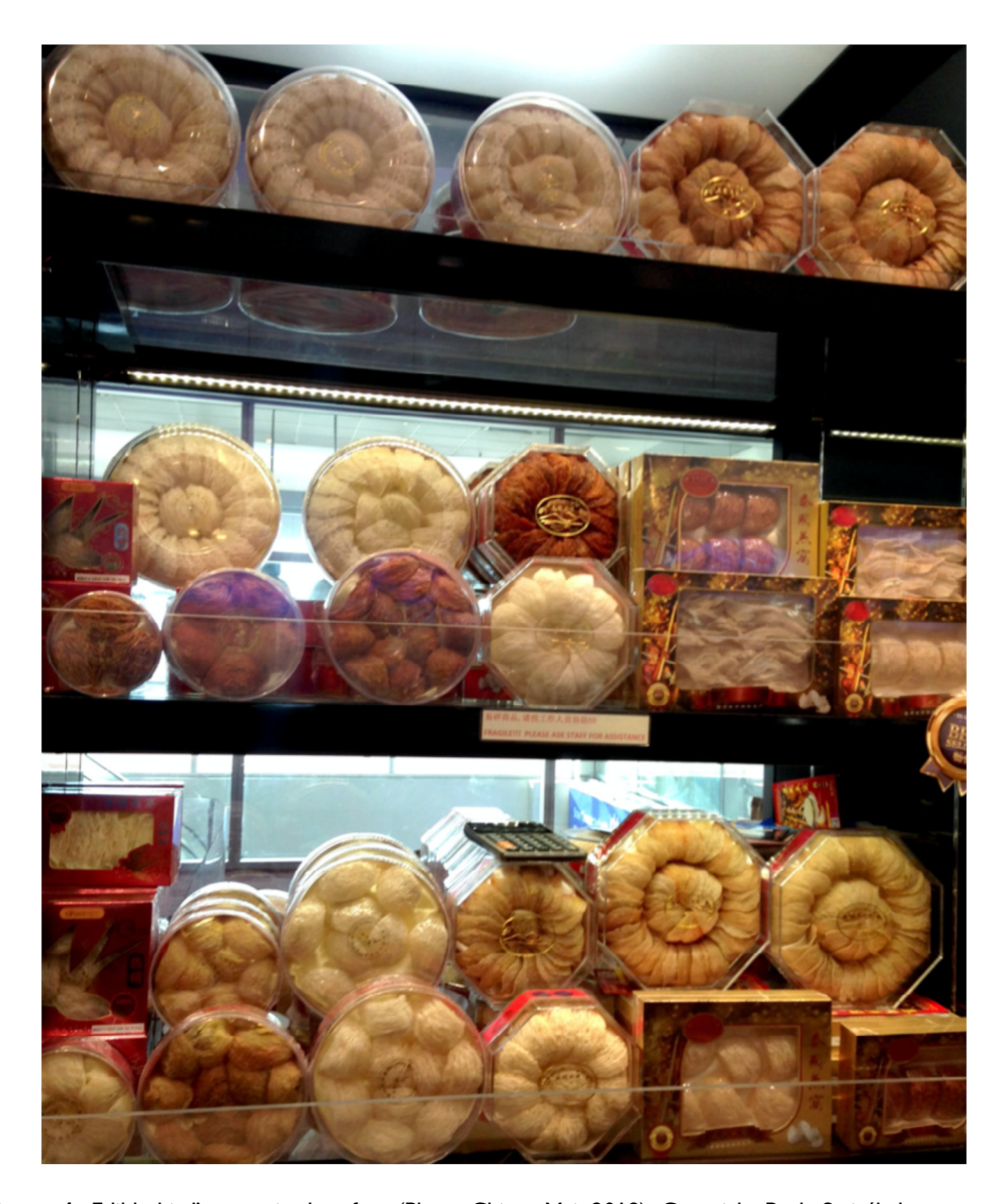
Figure 4. Edible bird's nests in duty free (Photo Chiang Mai, 2018).