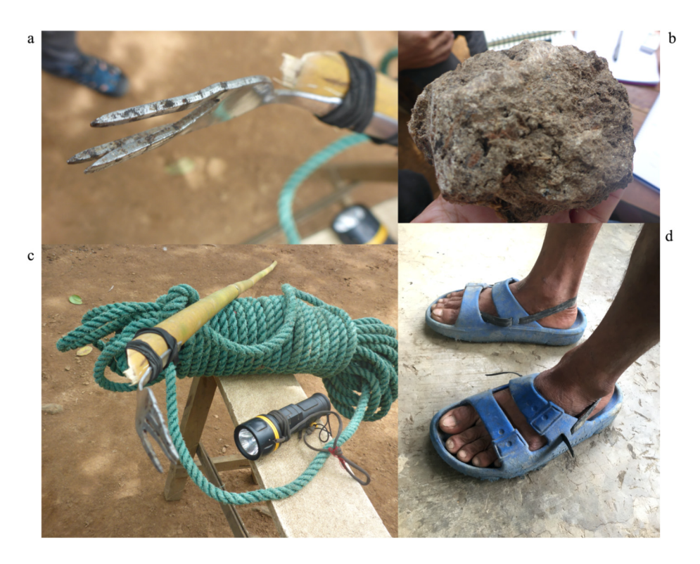
Figure 3. Busyador harvesting tools: a) modified fork, b) saheng (resin), c) sungkit (bamboo pole), rope, and flashlight; d) modified sandals.

nest strands to manually clean them by carefully removing mixed feathers and other 'impurities' with tweezers. The nests ( luray ) are claimed to boost the human body's energy and strength, attributes perceived by Chinese traders centuries ago, and, more recently, Cuyonon and other migrant traders (De Vera and Zingapan, 2017). At the extractive end, the busyador consume the leftovers, sinisa , from the cleaning process. Sinisa are often mixed in water infusions, porridges, and smoked inside coal-burnt coconut shells for suob and binat (i.e. postpartum care and sickness) to treat stomach aches, feet swelling, and arthritis. Many busyador also feed sinisa to roosters to increase their strength during cockfighting, a common post-harvest game when busyador have more income.