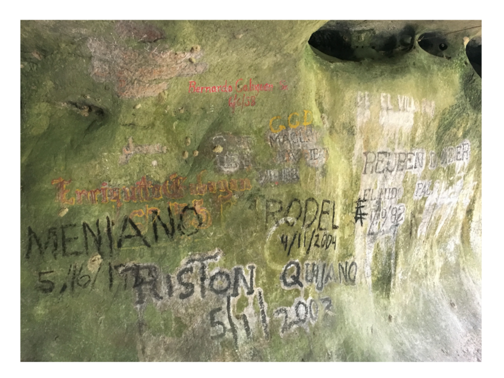
Figure 5. Busyador names in walls.

The dramatic decline in the abundance of balinsasayaw is inseparable from the history of environmental degradation and gradual dispossession of the Tagbanua busyador from the seascapes of northern Palawan. In Taytay, the volume of harvested nests has decreased from 80.5 kg in 2011 to 62.03 kg in 2014 (Cadigal, 2015, 29). Partly due to increased regulations, the reduction in the volume of nests traded has negatively impacted the livelihoods of concessionaires and the busyador. Concessionaires are under pressure to recover their financiers' investments and manage the harvest (covering food, license fees, guarding, transport expenses, and labor), which has reduced