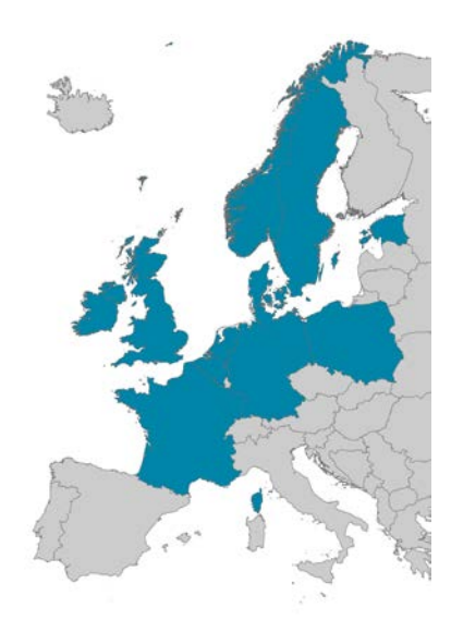
Figure 1. Countries that have experts in the WGMBRED.

How these devices might affect the marine environment, locally, regionally and on larger spatial scales, is currently investigated by ecologists who are continuously improving their understanding of these effects. Following this necessity to ensure proper knowledge exchange between scientists, an ICES workshop "Effects of offshore wind farms on marine benthos" (WKEOMB, see ICES 2012) was initiated in 2012. The aim of this workshop was to increase scientific efficiency of offshore wind farm benthos research, to discuss the most actual results and to facilitate a closer international collaboration throughout the North Atlantic region. The workshop highlighted the importance of a regular knowledge exchange which lead to the establishment of the working group on marine benthal and renewable energy developments in 2013.