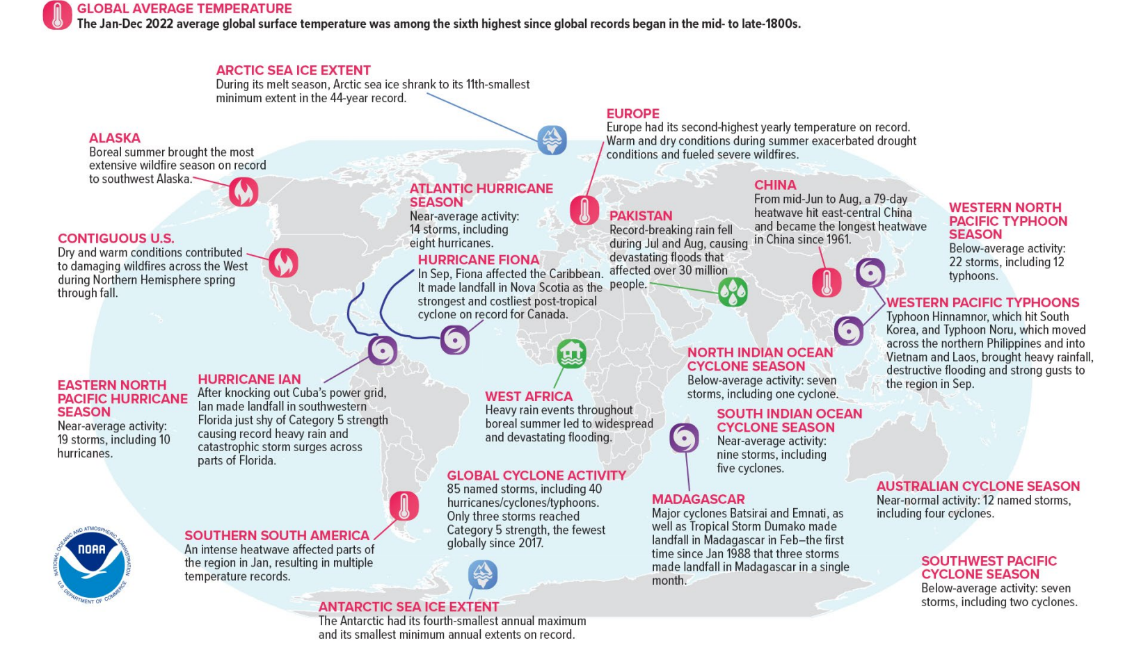
Fig. 1.1. Geographical distribution of selected notable climate anomalies and events in 2022.