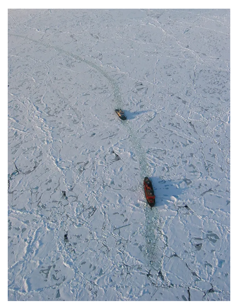
In heavy sea ice conditions, a powerful icebreaker becomes a necessity. This aerial view shows the smaller Swedish icebreaker Oden following the Russian nuclear-powered icebreaker 50 Let Pobedy.

Since 2015, the SAS group has held successive international workshops in Japan, Russia, Sweden, and the United States. And in June 2018, the group published a comprehensive, peer-reviewed <u>science</u> <u>plan</u> that includes information about the ships involved, proposed cruise tracks, and the measurements to be made. National teams have been established, and proposals have been submitted or funded. In October 2018, an SAS Scientific Steering Committee was established at a meeting at Woods Hole Oceanographic Institution.