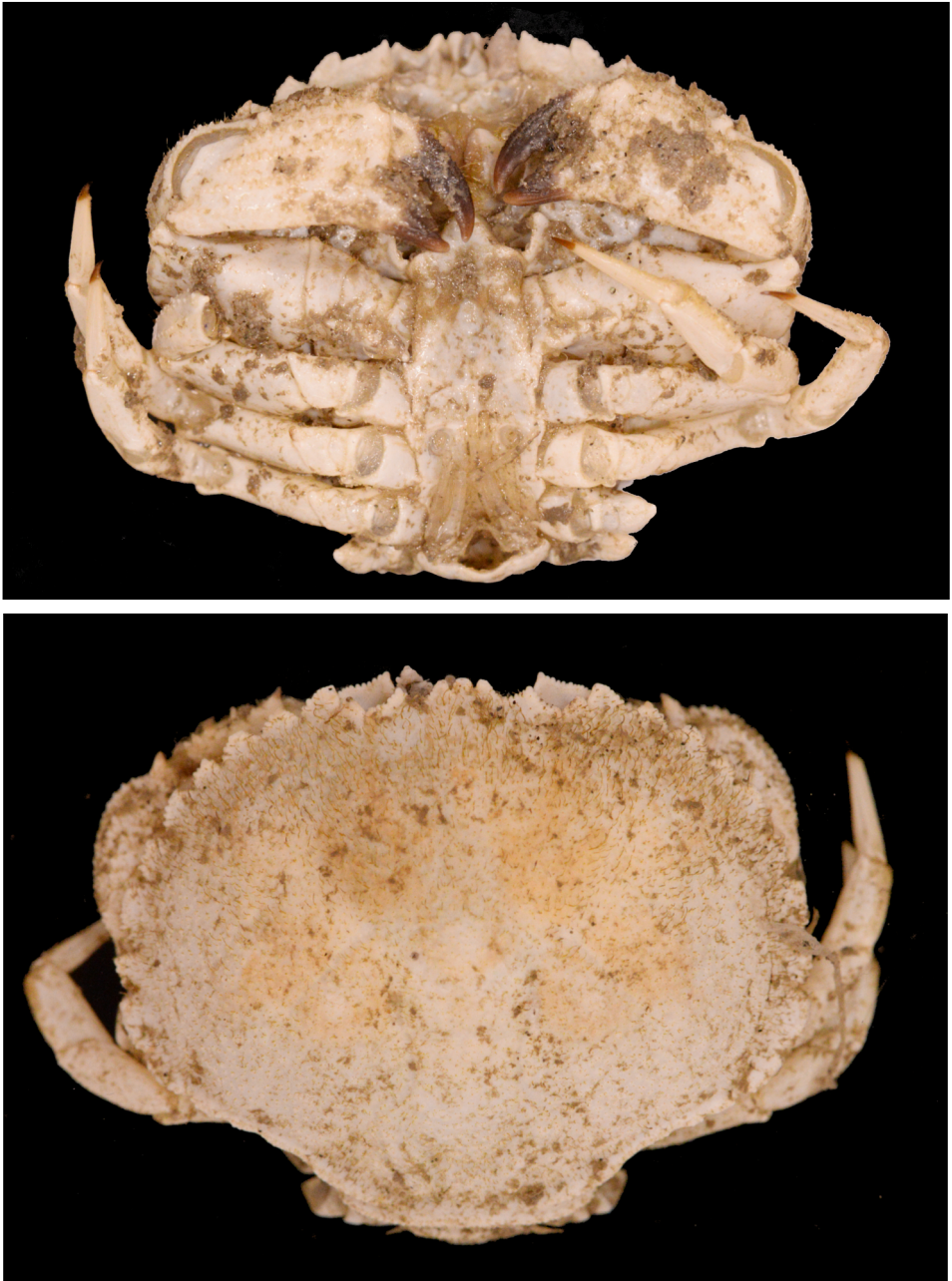
Fig. 2. Atelecyclus undecimdentatus (Herbst, 1783); RMNH.CRUS.D.57976; CW = 37.0 mm, Velsen Noord, Noord-Holland, the Netherlands, 10 April 2021. Top figure, specimen in ventral view; bottom picture, same in dorsal view.