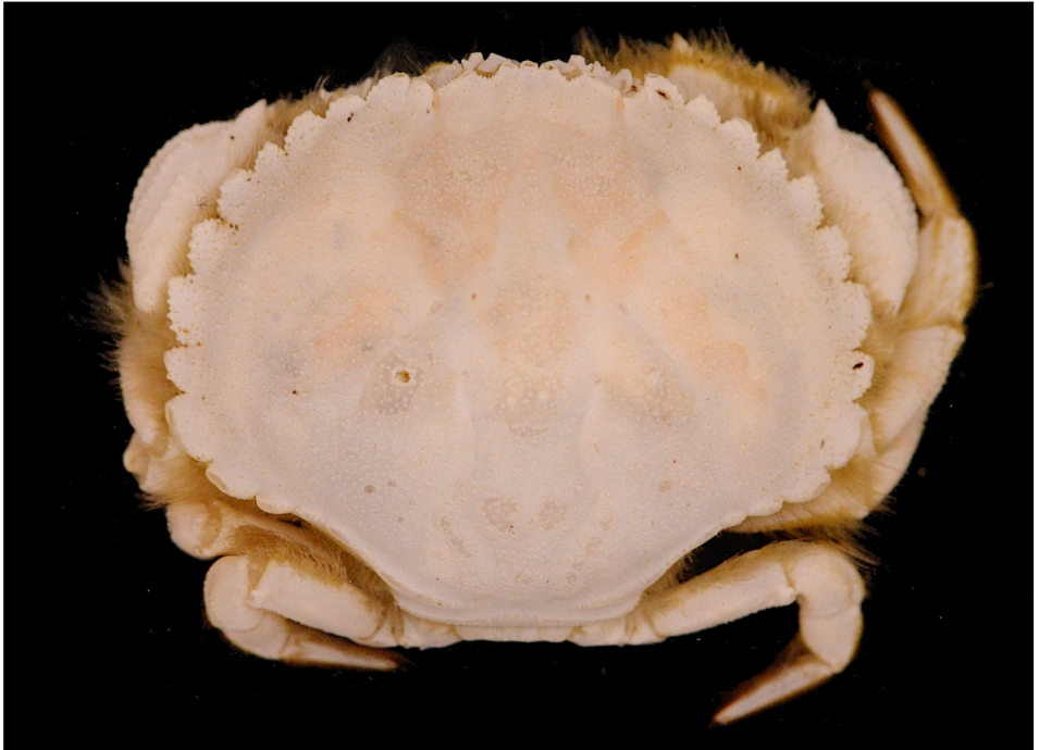
Fig. 3. Atelecyclus undecimdentatus (Herbst, 1783); RMNH.CRUS.D.57975; CW = 42.0 mm, Katwijk aan Zee, Zuid-Holland, the Netherlands, 11 April 2021. Specimen in dorsal view.

Pesta, 1918: 383, fig. 123; Balss, 1921: 55, fig. 7; Monod, 1933: 500, figs. 11A, 11B; Barnard, 1950: 198; Capart, 1951: 136.