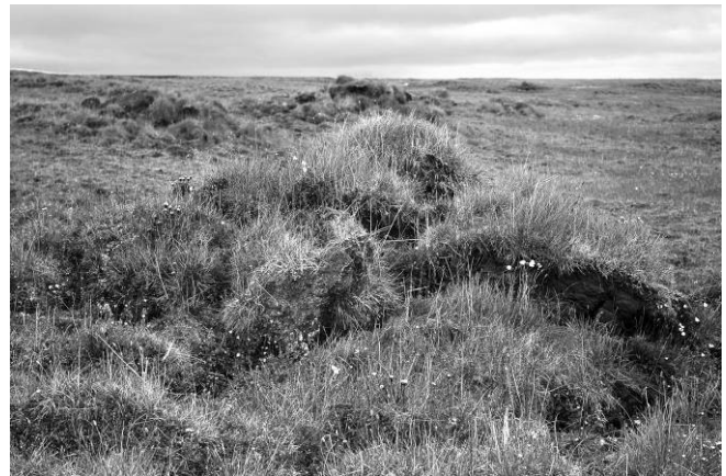
Figure 4: Thermokarst mounds on the Yedoma at Oyogas Yar

Thermokarst mounds are the best drained habitats in the study area (Fig. 4). Their plant cover is mainly composed of Salix polaris , Dryas punctata , and Alopecurus alpinus . Other grasses such as Festuca brachyphylla and Deschampsia borealis and dicots like Potentilla hyperctica , Oxyria digyna , Papaver polare and Valeriana subcapitata also occur.