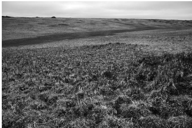
Figure 6: Lower part of a Yedoma slope with dominating Arctagrostis latifolia . In the background, a thermo-erosional valley with reddish spectral signature (here: dark) is visible

At Yedoma slopes, the coverage is in general > 80%. In the upper parts of slopes in SW exposition, Dryas punctata is one of the main constituents. Salix polaris and several grass species ( Alopecurus alpinus , Deschampsia borealis and Festuca brachyphylla ) and Luzula confusa are characteristic of Yedoma slopes. In lower parts of the slopes, where it is less drained and consequently moister, Arctagrostis latifolia , Petasites frigidus , several saxifrages ( S. nelsoniana , S. cernua , S. hieracifolia ) and other herbs ( Gastrolychnis apetala , Tephroseris atropurpurea , Ranunculus spp. ) are typical (Fig. 6).