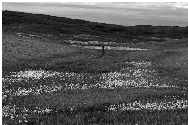
Figure 8: Thermo-erosional valley intersecting the Yedoma of Oyogos Yar. Main constituent is here Eriophorum scheuchzeri causing a green spectral signature.

Thermo-erosional valleys are permanently supplied by running water. They are characteristically colored and recognizable from far distant (Fig. 6). Dark green and reddish signatures are mainly caused by different Eriophorum species: green – E. scheuchzeri , red – E. polystachion (Figs. 6 & 8). Other plants of thermo-erosional valleys are Petasites frigidus and several crowfoot and grass species ( Dupontia fischeri , Calmagrostis holmii ).