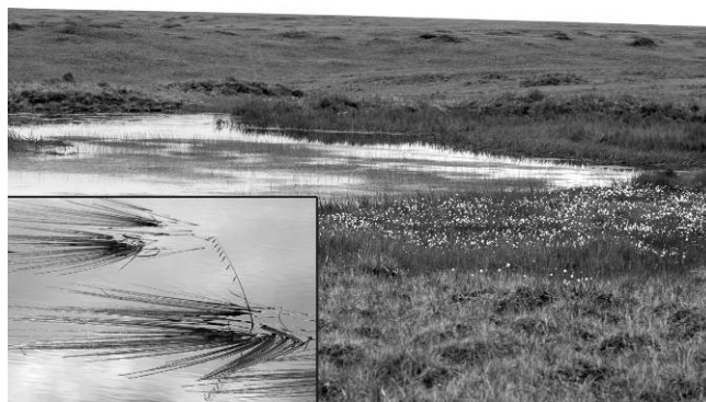
Figure 7: Thermokarst pond with dominating Pleuropogon sabinei growing emerged in the water (inserted photo)

Interestingly, genuine aquatics were widely lacking. Only Hippuris vulgaris was solitarily found in a sterile form. The white-flowered Ranunculus pallasii and Caltha palustris grew emerged in some ponds within the Alas depressions.