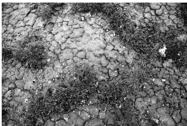
Figure 5: Mud boil at the top of the Yedoma visible in Fig.3