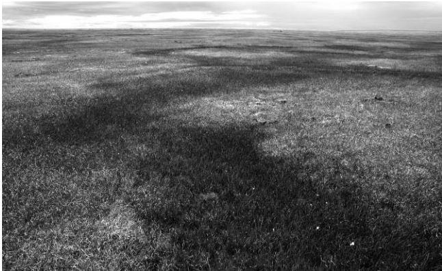
Figure 10: The wettest places in high center polygonal wetland tundra are the inter-polygonal trenches. Here, Eriophorum polystachion is the main constituent, causing a reddish (here dark) pattern.

( Dupontia fischeri , Calamagrostis holmii , Poa alpigena and Arctophila fulva ). The wettest places are almost exclusively occupied by Eriophorum polystachion , which produces reddish patterns on the ground indicating the water trenches between polygons from afar (Figs. 9 & 10).