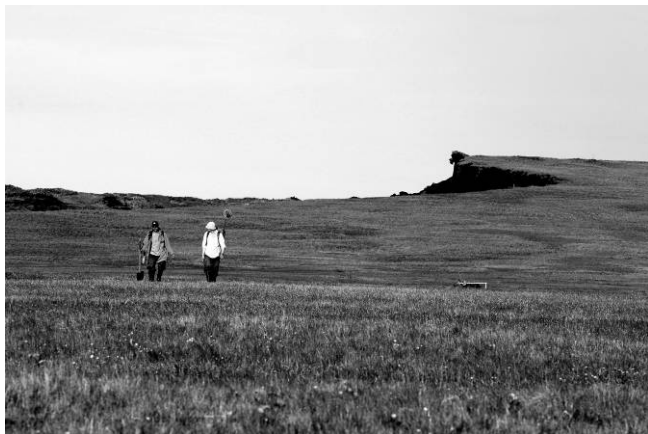
Figure 3: View from the alas bottom to the Yedoma hill

The study transect extends across the bottom of a large alas depression of about 10 km in diameter (5 to 10 m a.s.l.) and the adjacent slope and top areas of a Yedoma hill of up to 40 m height (Figs. 2 & 3). The alas bottom dominantly consists of polygonal wetland tundra with a 0.5 to 1.0 m thick peat cover.