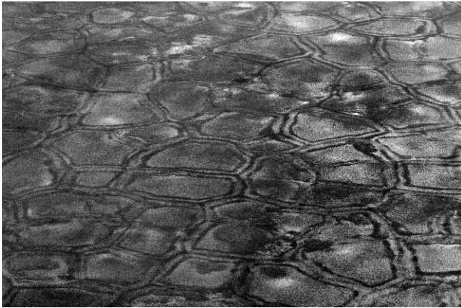
Figure 9: Bottom of a thermokarst depression with a water table above the ground. The polygonal surface patterns are visually strengthened by vegetational differentiation (compare Fig. 10).

At sites outside water bodies, rushes ( Luzula nivalis , L. confusa ) cover large areas together with several grasses