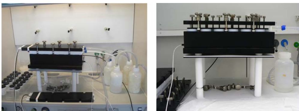
Figure S1: Left: Experimental setup for concentration of liquid samples before the addition of acids and after acid digestion. Right: Experimental setup for the acid digestion of Antarctic ice core samples.