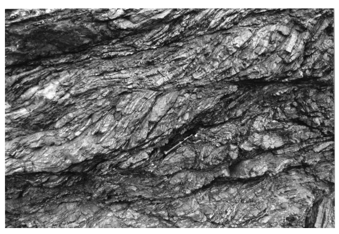
Fig. 5: a) NW-directed cataclastic shear zone, at the northern tip of Vikenegga. View to the SW; b) detail of Fig. 4a; sigmoidal shear bodies, indicating NW-directed sense of shear.

Abb. 5: a) Kataklastische Scherzone an der Nordspitze Vikeneggas, Blick nach SW. b) Detail von Abb. 4a; sigmoidale Scherkörper zeigen einen NW-gerichteten Schersinn.