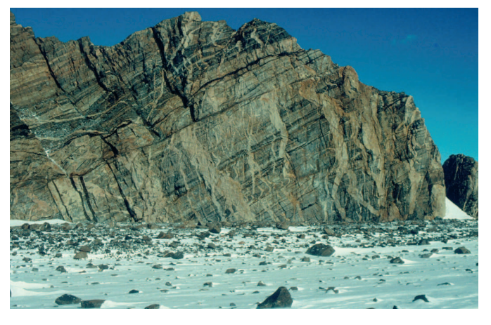
Fig. 4: Northern part of Vikenegga nunatak, metatonalite-trondhjemite-diorite suite (KTT), intruded by anastomosing coarse-grained pegmatites, which gave a U-Pb zircon age of 1060 \pm 8 Ma (ARNDT et al. 1991). Note the subvertical mafic dykes, postdating the pegmatites on the left hand side. The thrust in the centre cuts all rock units and contains biotite that gave a Lower Palaeozoic K-Ar age of 473 \pm 11 Ma (JACOBS et al. 1995). Height of the wall approx. 200 m, view to SW.

Three deformation events are recognized in the Kottas Terrane (Bauer 1995, Jacobs et al. 1996). The older two fold phases (F<sub>1</sub> and F_2 ), well preserved in the supracrustal gneissses, are probably of Late Mesoproterozoic age, whereas the third (F_3) is possibly of Neoproterozoic to Cambrian age. Earliest F<sub>1</sub> isoclinal folds, identified at the eastern end of Laudalkammen, are refolded by F_2 folds. The latter are typically tight to closed, with axes gently plunging to the SE, and have a well developed axial planar foliation, which is the main foliation indicated in the stereograms on the maps. A SE- to south-plunging stretching lineation is locally developed. The main foliation is refolded by NE-SW trending, moderately SW-plunging F<sub>3</sub> fold axes. Both fold generations are exposed together at Waglenabben and Arntzenrustene, where their overprinting relations can be observed. Within the crystalline basement of the main massif of Kottasberge, a moderately SE-dipping metamorphic foliation can be found which, in places, is overprinted by a secondary, steeply south to SW dipping foliation (S_2) .