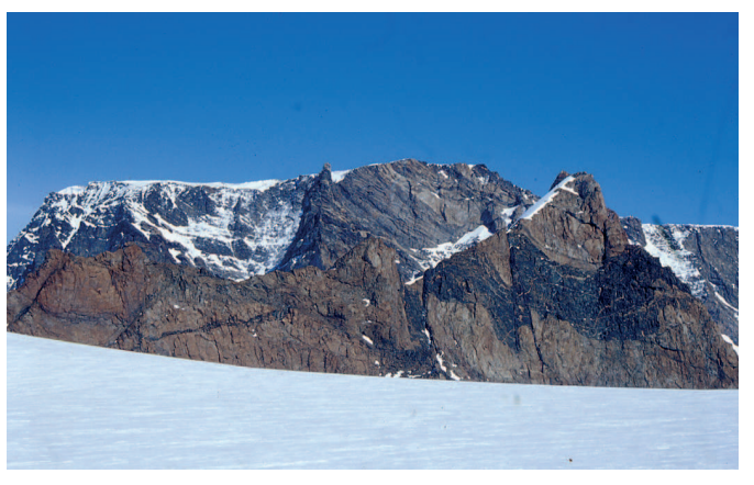
Fig. 6: Laudalkammen, seen from the East. The grey mass is the diorite (KD4), which intruded the pink Laudalkammen granite (KG3); both are dissected by subvertical faults.

The assumed boundary zone between the Kottas Terrane and the Sivorg Terrane is poorly exposed in two small nunataks, Hasselknippenova and Lauringrabben (sheet Vikenegga). The southern parts of both nunataks are made up of steeply S- to SSW-dipping mylonites, with a strongly developed stretching lineation plunging at 45-60° southwards. There, s-clasts clearly indicate that the Sivorg Terrane was thrust northwards over the Kottas Terrane with a significant subhorizontal strikeslip component. At this locality, the terrane boundary has a maximum width of 2 km. Farther south, at the nunataks of Haneborg-Hansenveggen (sheet Hanssonhorna), highly deformed rocks are absent; the bimodal metavolcanic rocks