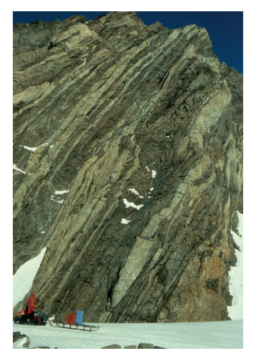
Fig. 3: Typical metatuffite sequence, exposed at Lütkennupen, view towards SW.

Abb. 3: Typische Metatuffit-Abfolge, aufgeschlossen am Lütkennupen, Blick nach SW.