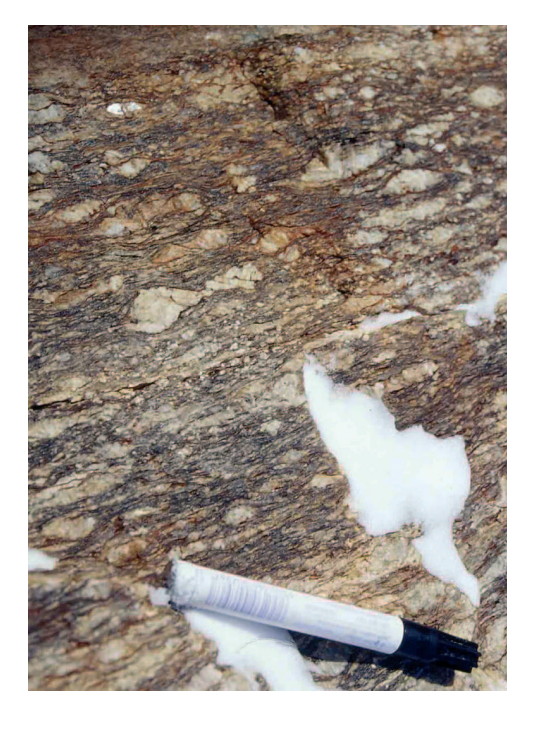
Fig. 2: Mylonitic augen gneiss (KG1), at Hasselknippenova, south of the Schivestolen massif. Aeoromagnetical data by GOLYNSKY & JACOBS (2001) show that this outcrop is part of the Heimefront Shear Zone which separates the Kottas from the Sivorg Terrane.

Abb. 1: Geologische Übersichtskarte der Heimefrontfjella.