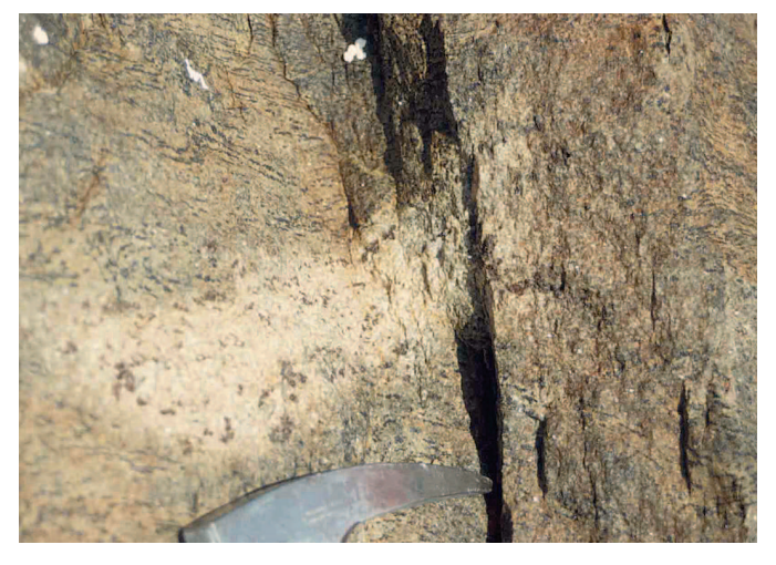
Fig. 2: Dehydration melting patch in leucogranite gneiss (above hammer head), western Vardeklettane.

Abb. 1: Geologische Übersichtskarte der Heimefrontfjella mit einer Detailkarte der beiden Vardeklettane-Nunataks.