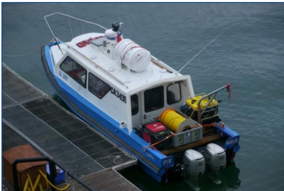
Figure 1: The San Ignacio (Huinay scientific station, Comau Fjord, Chile): an example of the smallest ship size still sufficient to host the whole system.