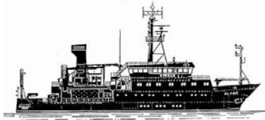
ALKOR 259 Kiel – Kiel, 10. – 22. 06. 2005