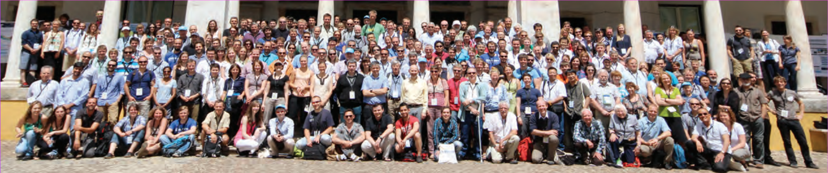
Group photo of EUCOP4 participants in Évora, Portugal. This figure is available in colour online at www.interscience.wiley.com/journal/ppp