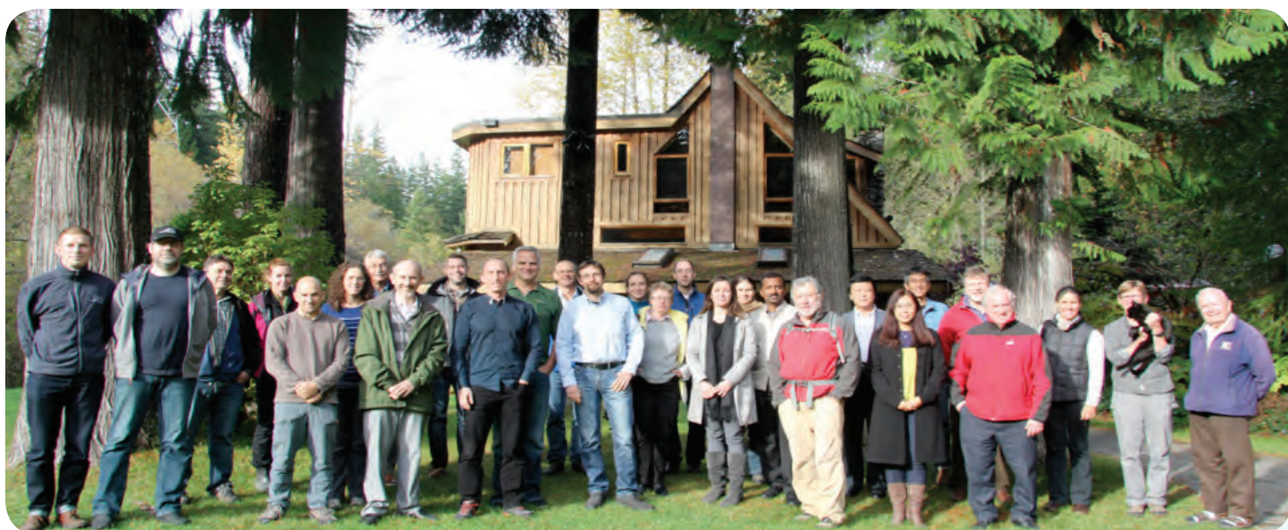
Participants of the 2014 workshop Impacts of permafrost thaw in mountainous areas of Canada and beyond :

It was recognized that an improved understanding of processes and phenomena is required, but also that many mountain regions in South America and in Asia have extensive permafrost areas of which we know little. Crucial knowledge gaps were identified relating to (a) how runoff and water quality are affected by changes in permafrost; (b) how ground thermal regime and ground ice contents vary spatially and in the future beneath mountain slopes; (c) how much carbon is incorporated into frozen deposits; (d) how vegetation and permafrost interact in mountains; and (e) how rock slopes and their stability respond to permafrost degradation.