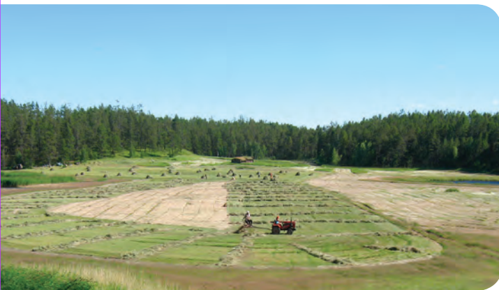
Large parts of the Central Yakutian lowlands are speckled with thermokarst basins, known as alas (alaa) and used by the local population for grazing cattle, making hay, and other forms of agriculture (Photo: M. Ullrich, July 2014).