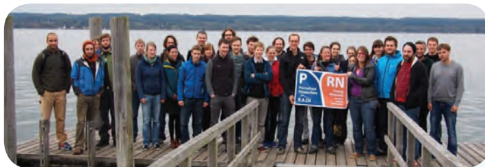
Group picture of PYRN-DACH at the 7 th AK Permafrost meeting, Wartaweil, Lake Ammer/Germany, hosted by the Technical University Munich.

A PYRN - DACH general assembly and workshop was organized during the 7 th annual meeting of the working group permafrost (AK Permafrost) of the German Society of Polar Research, which was hosted by