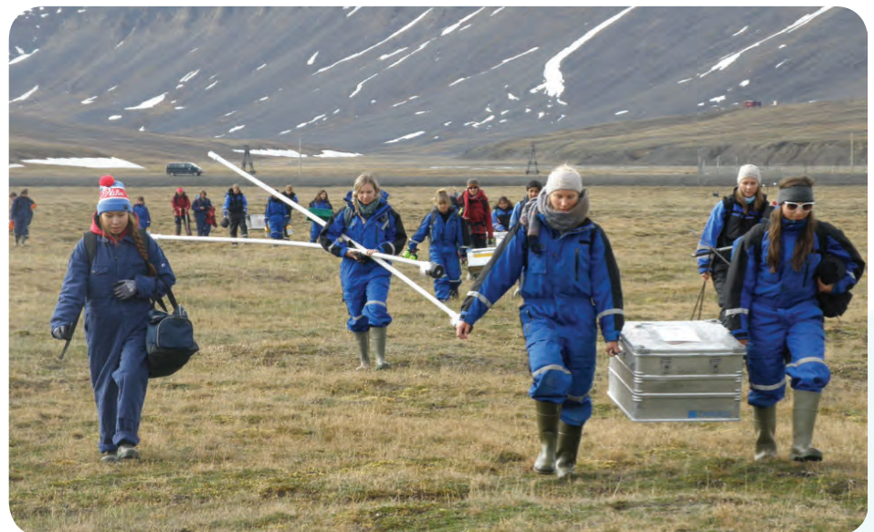
Students from the AG-218/219 International Bachelor Summer Fieldschool on their way to drill boreholes into permafrost in Adventdalen, Svalbard June 2014.

5. E&O committee ICOP2016 involvement: We are committed to support ICOP local organizers and help provide information. We need to ensure a close connection with ICOP E&O local organizers.