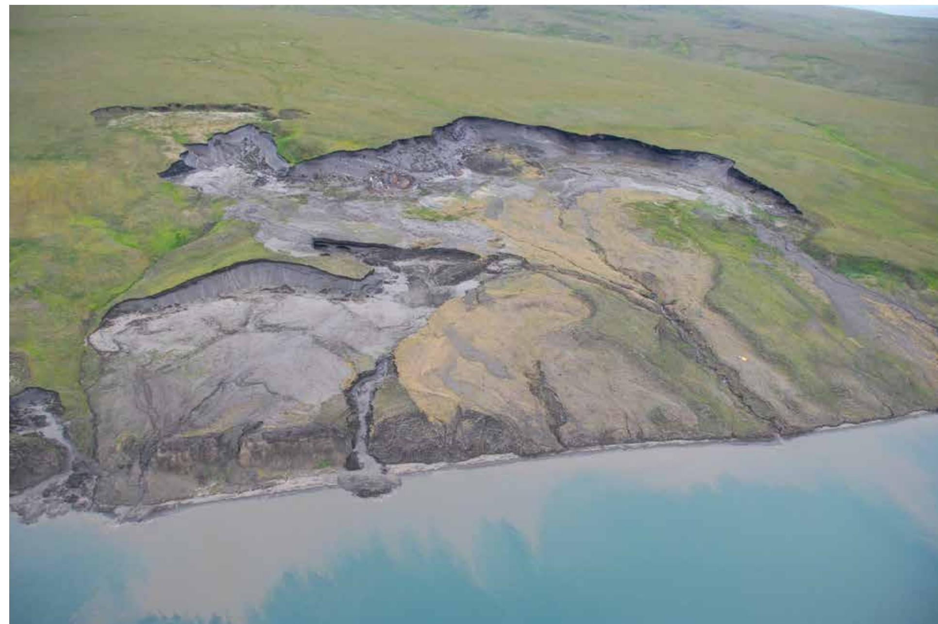
Coastal erosion delivers sediment, particulate and dissolved organic matter and nutrients to the nearshore zone.

[1] Alfred Wegener Institute Helmholtz Centre for Polar and Marine Research, Dept. of Periglacial Research, Potsdam, Germany [2] Utrecht University, Department of Earth Sciences, Utrecht, The Netherlands [3] Potsdam University, Institute of Earth and Environmental Sciences, Potsdam, Germany