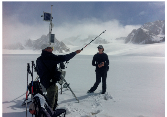
Fig. 3: Scene at the filming of the documentary "VERNAGT", describing long-term observation and scientific work on the Vernagtferner Glacier, Oetztal Alps, Austria.

The success of the project cannot be described in just one dimension. Looking at the general perception, more than 16,400 views of around 7,000 visitors of the website (as of 13 December 2014) document a clear success. For evaluating the quantitative success of these numbers it has to be considered that the project webpage was built from scratch and went online shortly before the conference on 1 October 2014. Moreover, the produced viral videos were viewed more than 2,000 times and the documentaries about 1,600 times. Meanwhile, requests for the re-use of documentary films by environmental organizations and research institutions have been received. The interdisciplinary REKLIM MEDIA PROJECT