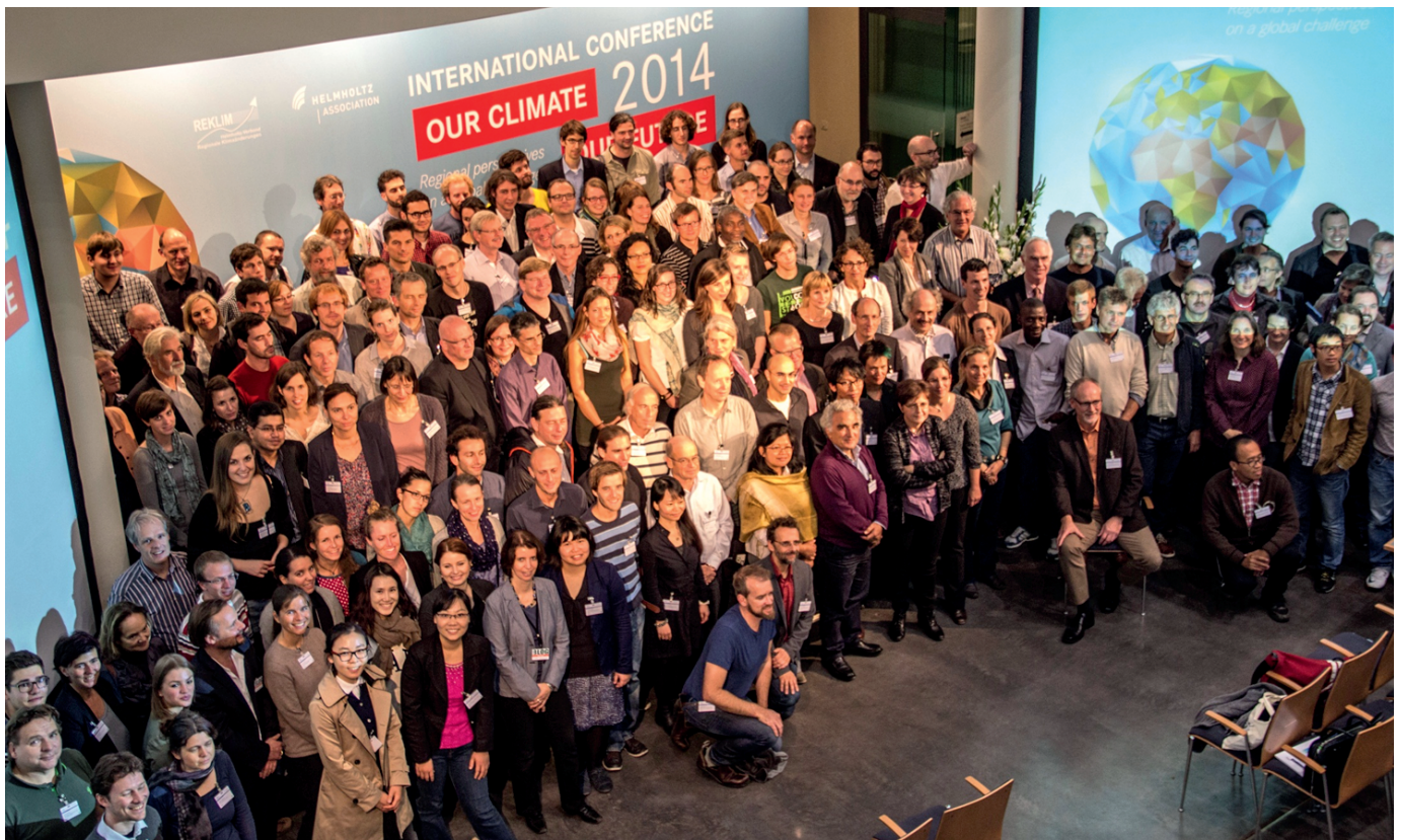
Fig. 2: Group picture of the participants of the REKLIM international conference 2014, Berlin, Germany.

The GERMAN SOCIETY OF POLAR RESEARCH and the ALFRED WEGENER INSTITUTE HELMHOLTZ CENTRE FOR POLAR AND MARINE RESEARCH (AWI) offered to publish a conference volume of all papers related to the Arctic and Antarctic realms, as well as to all aspects on polar climate. The POLAR-FORSCHUNG (Polar Research) editors and the scientific steering committee (see authors of this contribution) of the conference welcomed original papers, scientific review articles and extended abstracts from natural as well as societal and