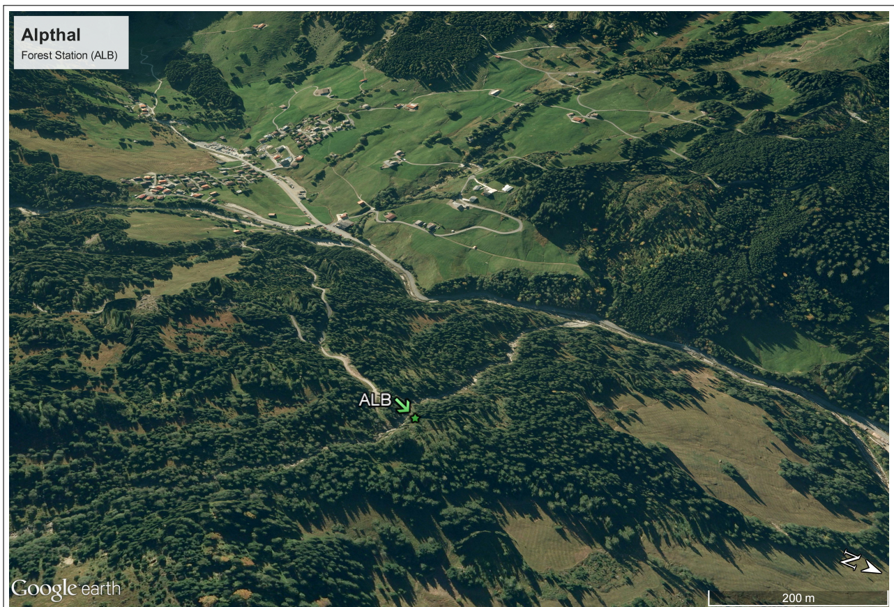
Figure 1: Site aerial photo from the Alpthal forest station.

The measurements were carried out at Alpthal in the Swiss Canton of Schwyz in the northern Prealps (Fig. 1). Time series of one plot within the forest have been recorded (Fig. 2). Tab. 1 shows further details on the research station characteristics.