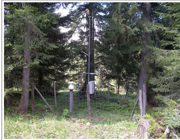
Figure 2: ALB: Forest station