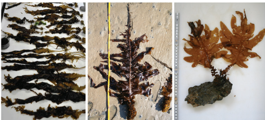
Figure 2: Undaria pinnatifida sporophytes collected at Sylt, Germany.

The community on the reefs was dominated by the filamentous brown alga Ectocarpus sp., stretching as a dense floating layer across the tide pools, with U. pinnatifida and other species (Table 1) growing underneath and between the Ectocarpus filaments. Thalli of U. pinnatifida grew in clusters of one to seven individuals as epibionts (attached to living surfaces) of other species (basibionts), with 34 clusters in total, spread over a system of connected tide pools no deeper than 30 cm during low tide.