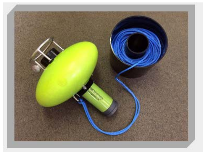
Above: Pop-up Buoy

https://www.mooringsystems.com/popup-buoys.htm