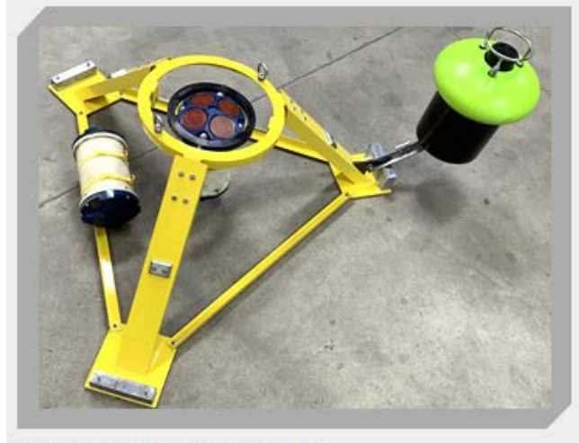
Above: Tri-Pod with RDI and Pop-up Buoy