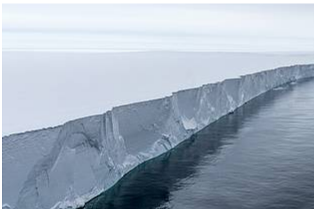
Pine Island Gletscher

Hundreds of subglacial lakes currently exist beneath the Antarctic Ice Sheet, with Lake Vostok being the largest and best known. The challenges involved in exploring these lake systems, which have remained enclosed for thousands of years, are enormous. For instance, scientists must adhere to strict environmental restrictions so as to avoid polluting the lakes, which involves considerable resources. To date, Russian researchers have only collected samples by drilling into the surface ice of Lake Vostok and testing the water that poured out of the borehole before promptly refreezing.