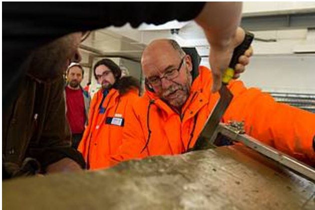
Sediment core

However, comparing the results of the climate simulations for the most recent interglacial with scenario calculations for the future reveals substantial differences: thanks to the more intense solar radiation, back then the air temperatures at higher latitudes were also a few degrees higher than at present. However, the carbon dioxide concentration in the atmosphere - roughly 290 ppm (parts per million) - was ca. 110 ppm lower than the current level, as ice core data from the Antarctic shows. For their scenario calculations, the AWI modellers plugged in atmospheric CO 2 concentrations in excess of 500 ppm, a level in keeping with the forecasts released by the Intergovernmental Panel on Climate Change (IPCC). Under these conditions, a disproportionately rapid retreat of summertime sea ice in the central Arctic Ocean over the course of the next few decades, followed by its complete disappearance - depending on how quickly CO 2 levels rise - roughly 250 years from now, is to be expected. The outcomes of the study reveal the complexity of the processes shaping climate change in the Arctic and point to significant spatial and chronological variances in sea ice cover. To slow the warming of the Arctic and the permanent loss of sea ice, reducing the level of anthropogenic CO 2 emissions in the atmosphere is vital.