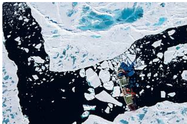
Aerial picture of RV Polarstern

Researchers at the Alfred Wegener Institute have now more closely analysed the glacial history of the central Arctic with the help of sediment core data and climate simulations. Their findings indicate that the