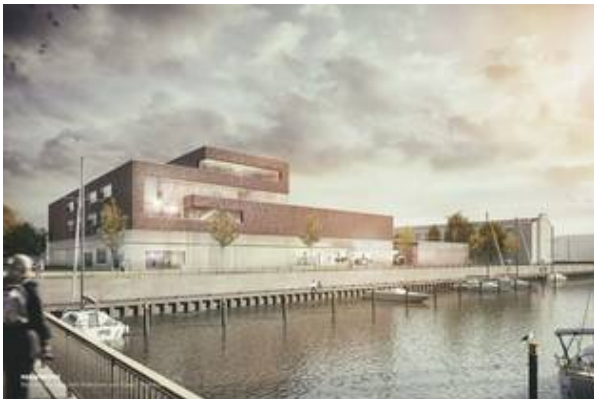
First design AWI Technology Centre

At the heart of the new campus of the Alfred Wegener Institute Helmholtz Centre for Polar and Marine Research (AWI), the building located on Klußmannstraße will stretch along the marina, and will include office and workshop areas as well as a large expedition preparation hall with high-bay storage facilities. In the future, in the new Technical Centre roughly 40 scientists and engineers will develop and test, among other things, ice drills in a 15-metre tower, or check the reliability of measuring devices under near-natural conditions.