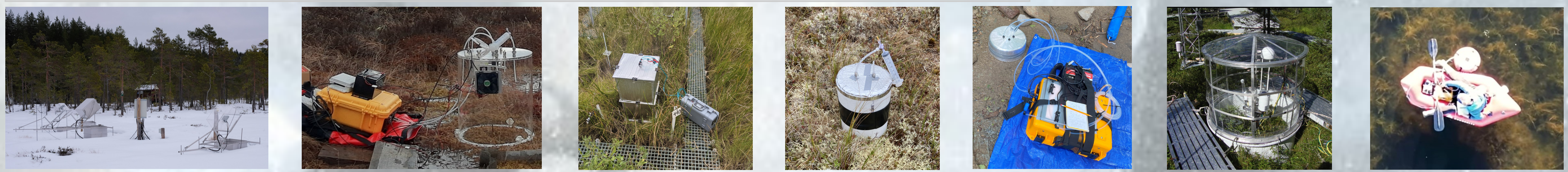
Various chamber measurement setups used by different research groups

Different measurement, flux calculation and quality control (QC) approaches for chamber measurements might introduce significant uncertainty to flux datasets and conceal actual temporal and spatial variations in CH 4 fluxes.