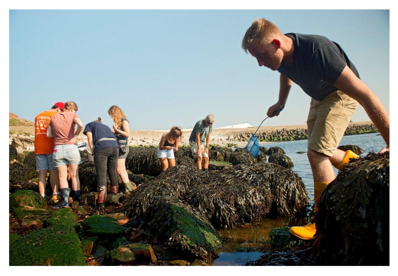
Figure 5: School lab OPENSEA taking samples in the intertidal