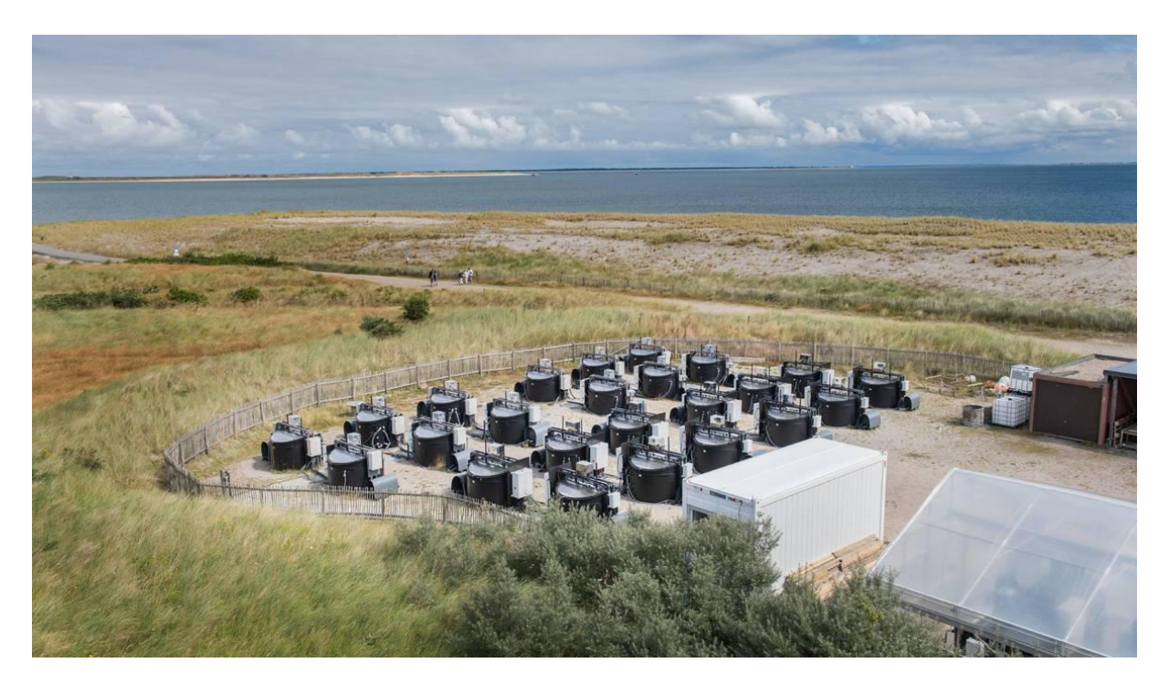
Figure 7: AWISOM mesocosms