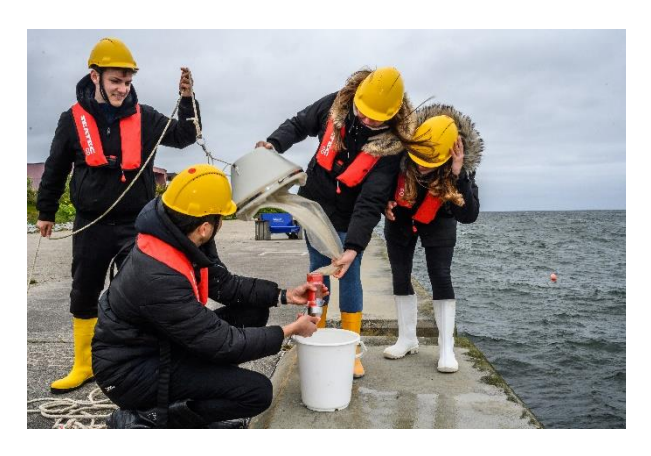
Figure 3: A university course takes plankton samples