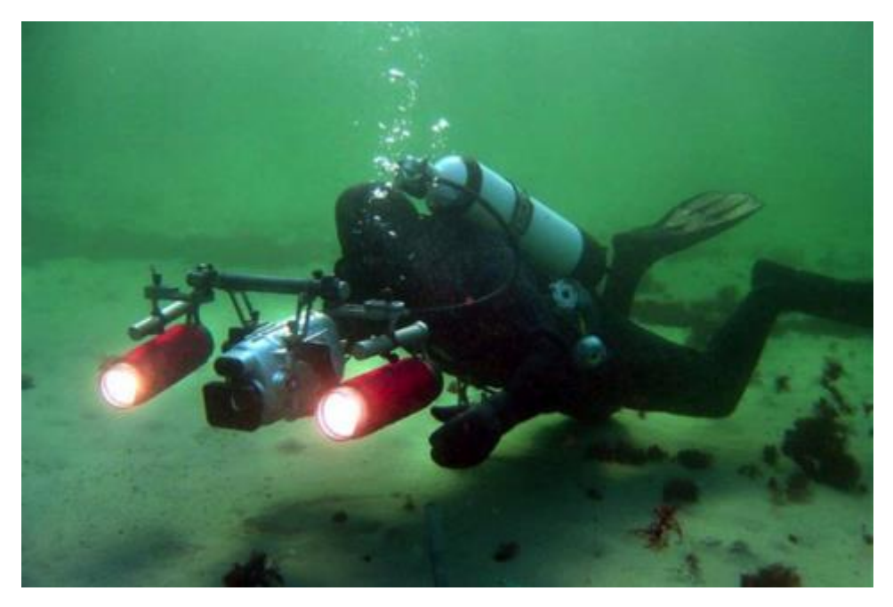
Figure 9: Diver with photo equipment

The <u>AWI-Centre for Scientific Diving</u> provides highly-trained year-round scientific diver support for the set-up and maintenance of sensors and experimental equipment within the MarGate underwater experimental area off Helgoland (Fischer al 2020, Fischer et al 2021). The area is about 270 x 100 m in size, located between 5 and 10 m water depth, and is officially classified as a maritime exclusive zone for ship traffic. Six tetrapod-fields have been installed in 5 and 10 m water depth to study the effects of artificial breakwaters on the shallow water fish and macro-invertebrate community. Since summer 2012, the MarGate field contains the first <u>German underwater node system</u> developed in the framework of <u>COSYNA</u>. This system provides continuous and manageable power and network access at 10 separate underwater mutable docking ports, each providing 48V/200W and 100 MBit/1 GBit network connection. Each port can be individually addressed and manage by its registered user (sensor owner) from anywhere in the world to remotely control and manage even complex sensor units. As well as basic hydrographical parameters from the area, the AWI operates multiple sensor systems for the main abiotic and biotic variables (temperature, salinity, depth, tide, turbidity, oxygen, chl-a fluorescence, 3D-current) in near real time (about 1 h delay).