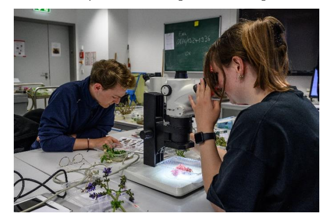
Figure 4: Students determining species with binoculars in the course room