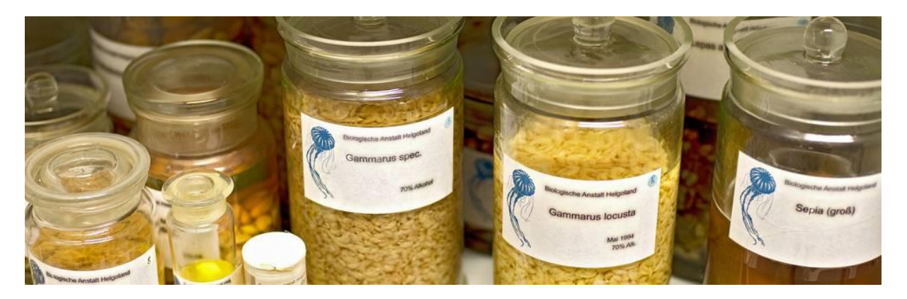
Figure 6: Conserved specimens in glass jars for university usage